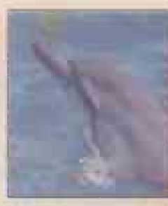
Dolphin Watch B-1