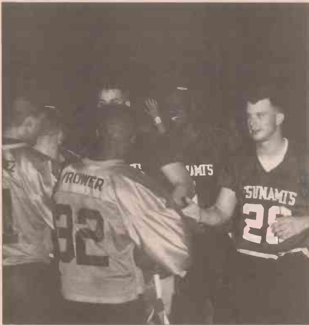
Players from the MALSEK Tsunamis congratulate the Headquarters Bn. Headhunters after the intramural football game at Pop Warner Field here Monday night. The 'Hunters continue to boast a perfect record in Intramural standings.