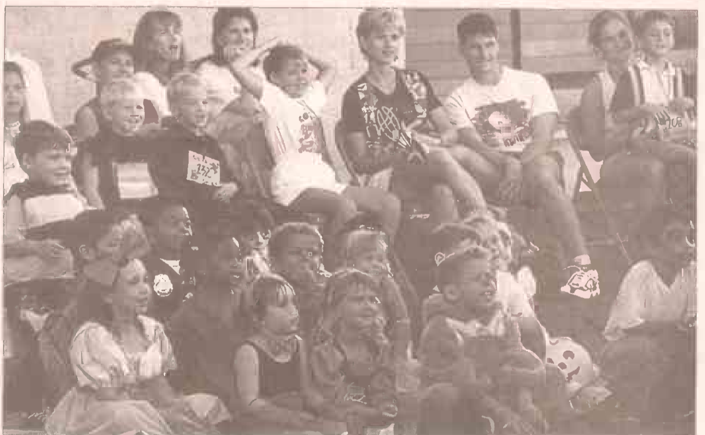
Children enjoy a magic show at the Goblin Gallop.