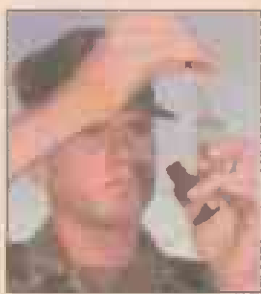
Water Purification, A-5