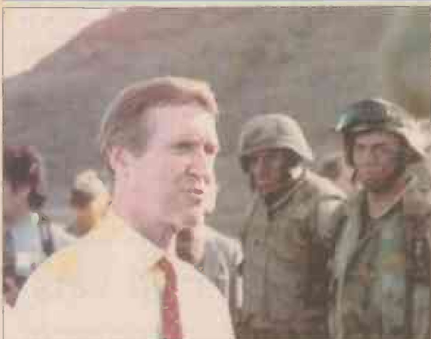
Secretary of Defense William Cohen talks with Marines at MCB Hawaii during a brief visit Friday.