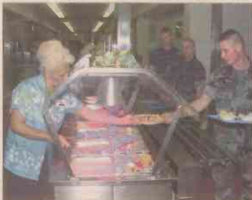
Patrons of Anderson Messhall go through the line for their lunch Oct. 29. Anderson Hall is one of 11 messes in the Marine Corps to compete for the best messhall in the Marine Corps.