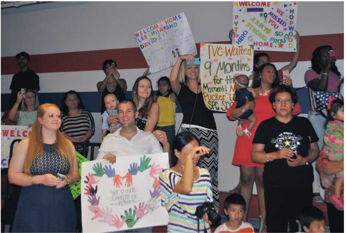
Families cheer as soldiers of the 62nd Signal Battalion, 11th Signal Brigade, enter West Fort Hood Physical Fitness Center on Sunday night after a nine-month deployment to Kuwait.