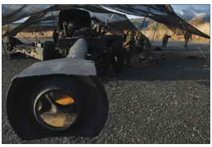
Gun 4 section prepares its M-198 155mm Medium Howitzer for firing April 19