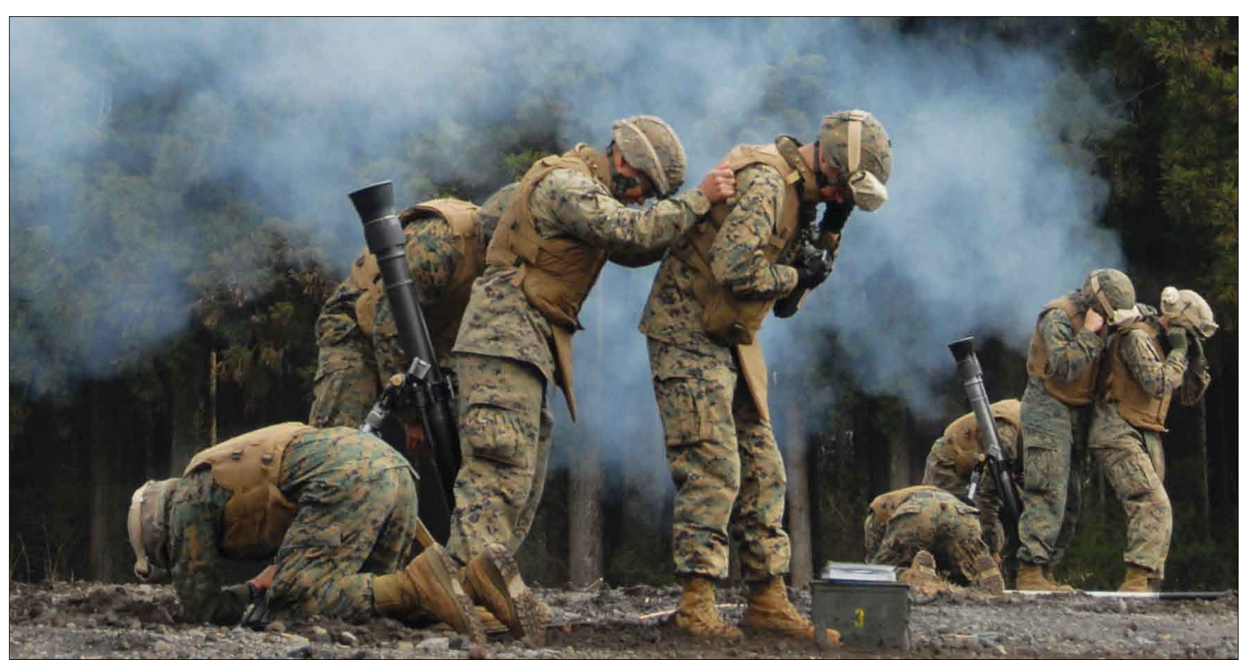
Marines with the 31st Marine Expeditionary Unit's 81mm Mortar Platoon fire M-252 81mm mortar systems in the East Fuji Maneuver Area at Combined Arms Training Center Camp Fuji April 20.