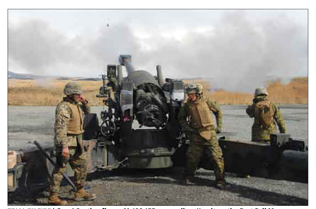
TRIAL BY FIRE | Gun 4 Section fires a M-198 155mm medium Howitzer the East Fuji Maneuver Area near Combined Arms Training Center Camp Fuji April 19. The Marines are with the 2nd Battalion, 1st Marine Regiment, currently serving as the 31st Marine Expeditionary Unit's battalion landing team. SEE STORY ON PAGE 10.