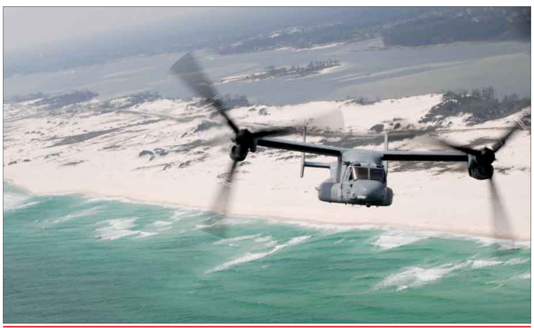
GULF OF MEXICO | An MV-22 Osprey from Marine Medium Tiltrotor Training Squadron 204, Marine Corps Air Station New River, N.C., flies over the Gulf of Mexico March 30.