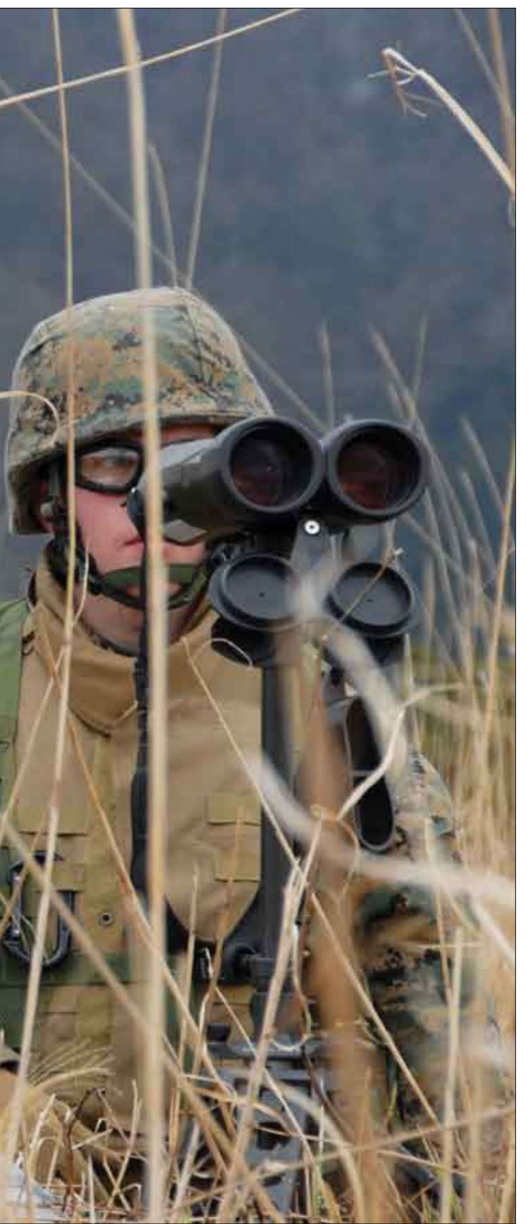
Center Camp Fuji April 18. Forward observers use binoculars,