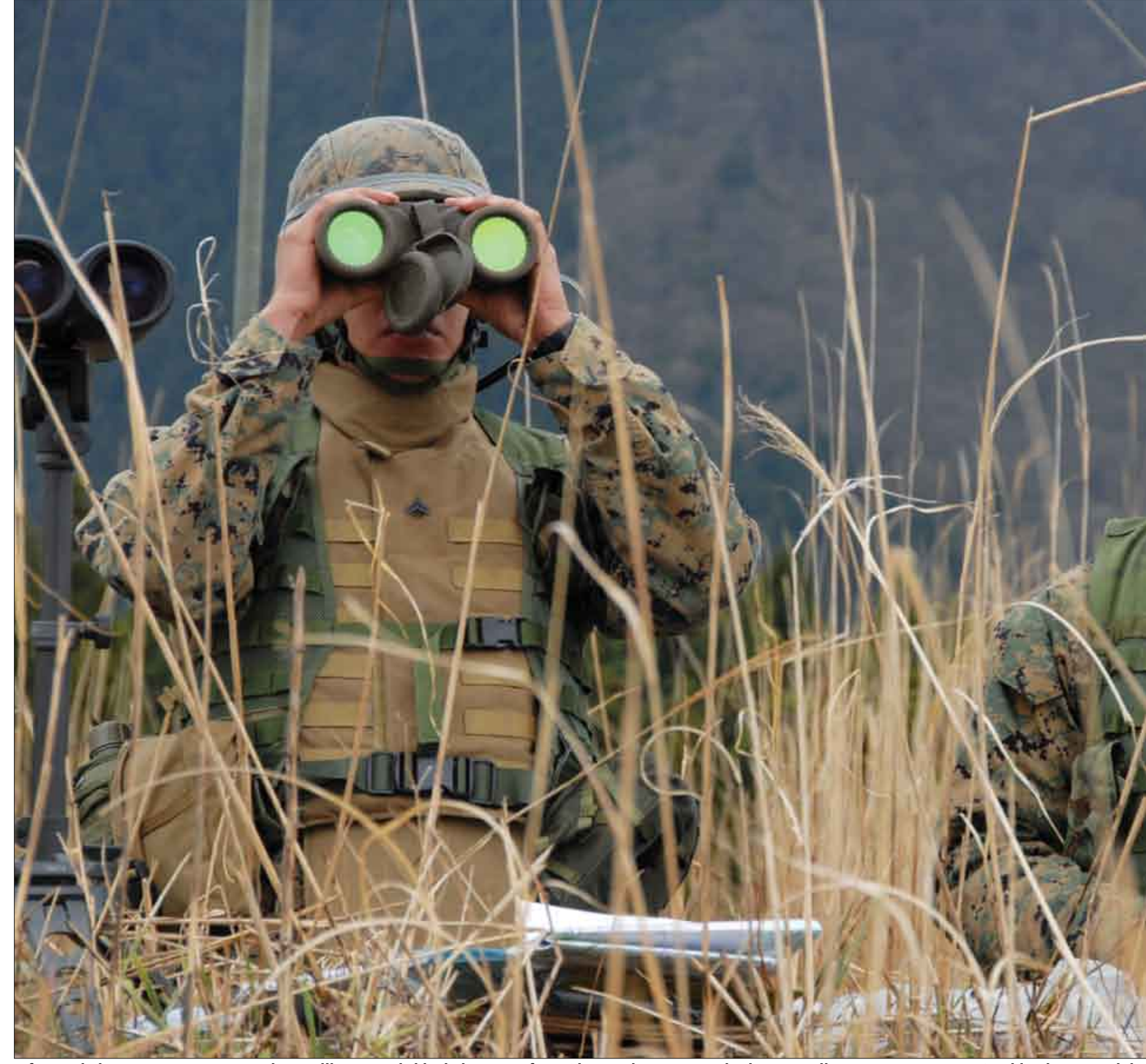
A forward observer scout team watches artillery rounds hit their target from Observation Post Fast in the East Fuji Maneuver Area near Combined Arms Training compasses, laser range finders, maps and Global Positioning Systems to determine target locations.