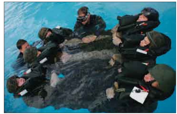
A raft formation decreases the energy Marines must exert to remain afloat.