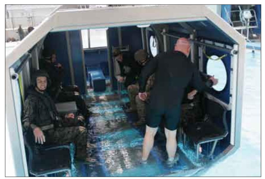
The modular amphibious egress trainer, commonly called the "helo dunker," can simulate the interior of a CH-46 or CH-53 helicopter.