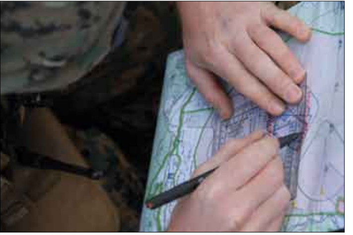
A forward observer plots the location of a target April 18 before transmitting the location to the FDC.

An M-198 155mm Medium Howitzer has a maximum effective range of more than 18 miles and is capable of firing a wide variety of rounds.