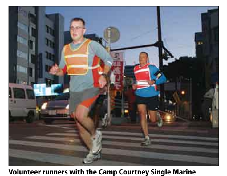
Program near the end of their leg of a 223-mile run around Okinawa to raise donations and awareness for the Rainbow Single Mothers' Shelter.

Currently, 22 residents live at the shelter where they share two washers and dryers, two full bathrooms and one kitchen. Though food is readily available, other essential items such as school supplies for the children and basic hygiene products are often in short supply as there are limited public funds available to