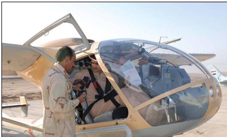
An Iraqi Air Force engine mechanic assists two pilots prior to take-off at the Basrah Air Station Feb. 17. Squadron 70 conducts intelligence, surveillance and reconnaissance missions.