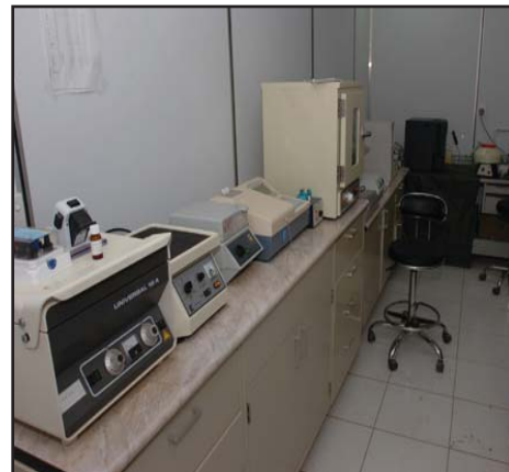
Blood samples are analyzed at the laboratory at the Taji Regional Clinic.

"We train the medics to deal with a patient when an emergency really happens, I want to see them do their job efficiently – they must know how to treat