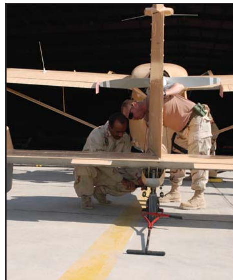
A Coalition advisor shadows an Iraqi mechanic as he services a Seabird Seeker SB7L-360A.

As much as the squadron likes to fly with their Coalition partners, the aircraft they maintain only provides seating for two. Although small in size the aircraft performs a large task.