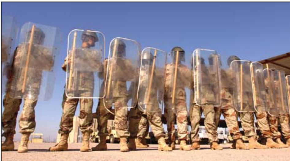
Iraqi military police students form a strategic formation while responding to a simulated riot during training Feb. 22 in An Numaniyah, Iraq.

"We hope that one day the people of Iraq learn the teamwork that we have learned here at this school. How to work together as a team; one for all, all for one."