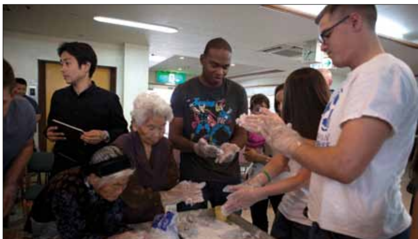
The staff and residents of Hikarigaoka nursing home form a substance known as mochi, with service members of 7th Communication Battalion Jan. 17 in Kin Town. Eating mochi is thought to promote good health, longevity and prosperity over the course of the New Year. The service members are with 7th Comm. Bn., III Marine Expeditionary Force Headquarters Group, III MEF.