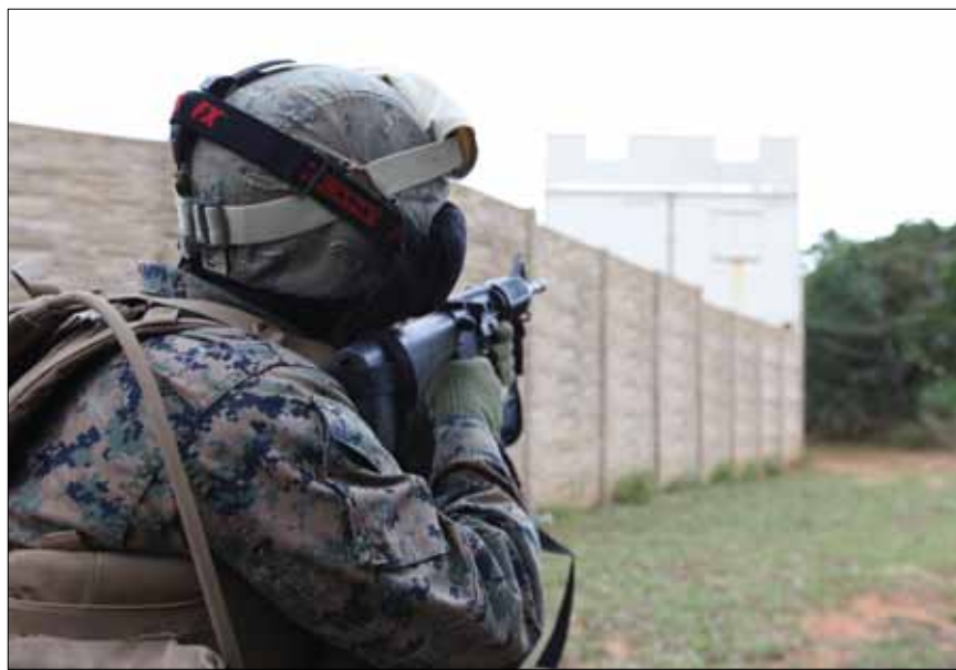
A Marine with 3rd LE Bn. prepares to return fire Jan. 16 during MOUT training in the Central Training Area. During the training event, Marines used simulated rounds to mimic combat operations in a controlled environment.

Throughout the exercise, the Marines of Company B, 3rd LE Bn., acted as an opposing force for Marines with Company A.