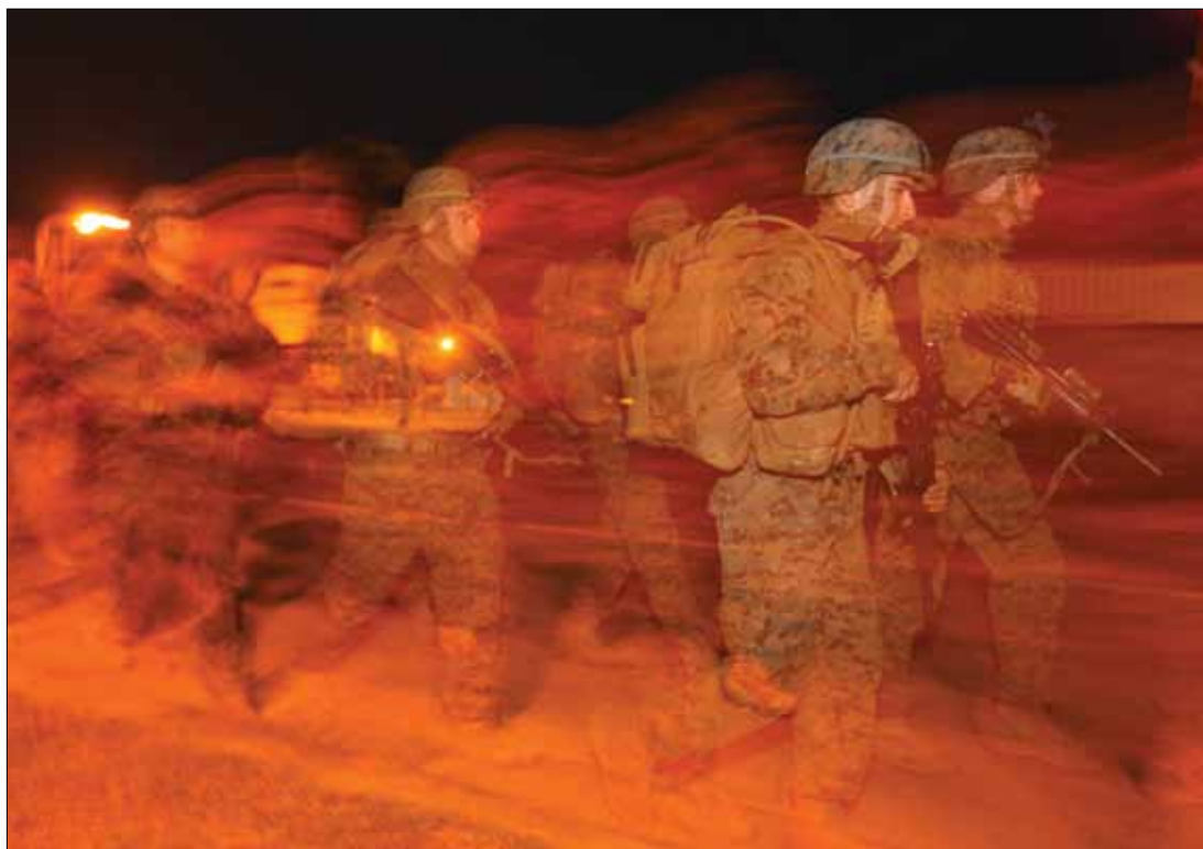
Marines quickly move to their first event during a squad competition Jan. 11 at Camp Hansen. Nine squads competed in events designed to test physical endurance, hand-to-hand combat, teamwork and military knowledge. The competition also built morale and cohesion throughout the squads. The Marines are with Company E, Battalion Landing Team 2nd Battalion, 5th Marines, 31st Marine Expeditionary Unit.