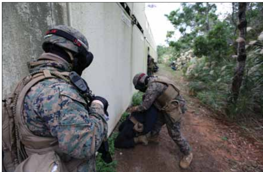
A Marine with 3rd LE Bn. searches and secures a simulated enemy combatant while another provides security Jan. 16 during MOUT training at Combat Town in the Central Training Area. Marines with the battalion perfected a variety of skill-sets from patrolling to room clearing in preparation for future operations and exercises, as well as increasing their overall combat readiness.