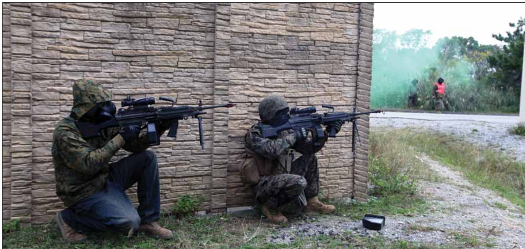
Two Marines with 3rd Law Enforcement Battalion return fire on a hostile building housing a force of simulated enemy opposition Jan. 16 during military operations on urbanized terrain training at Combat Town in the Central Training Area. The green smoke in the background was used so another group of Marines could move to a safe location under concealment. 3rd LE Bn. is part of III Marine Expeditionary Force Headquarters Group, III MEF.