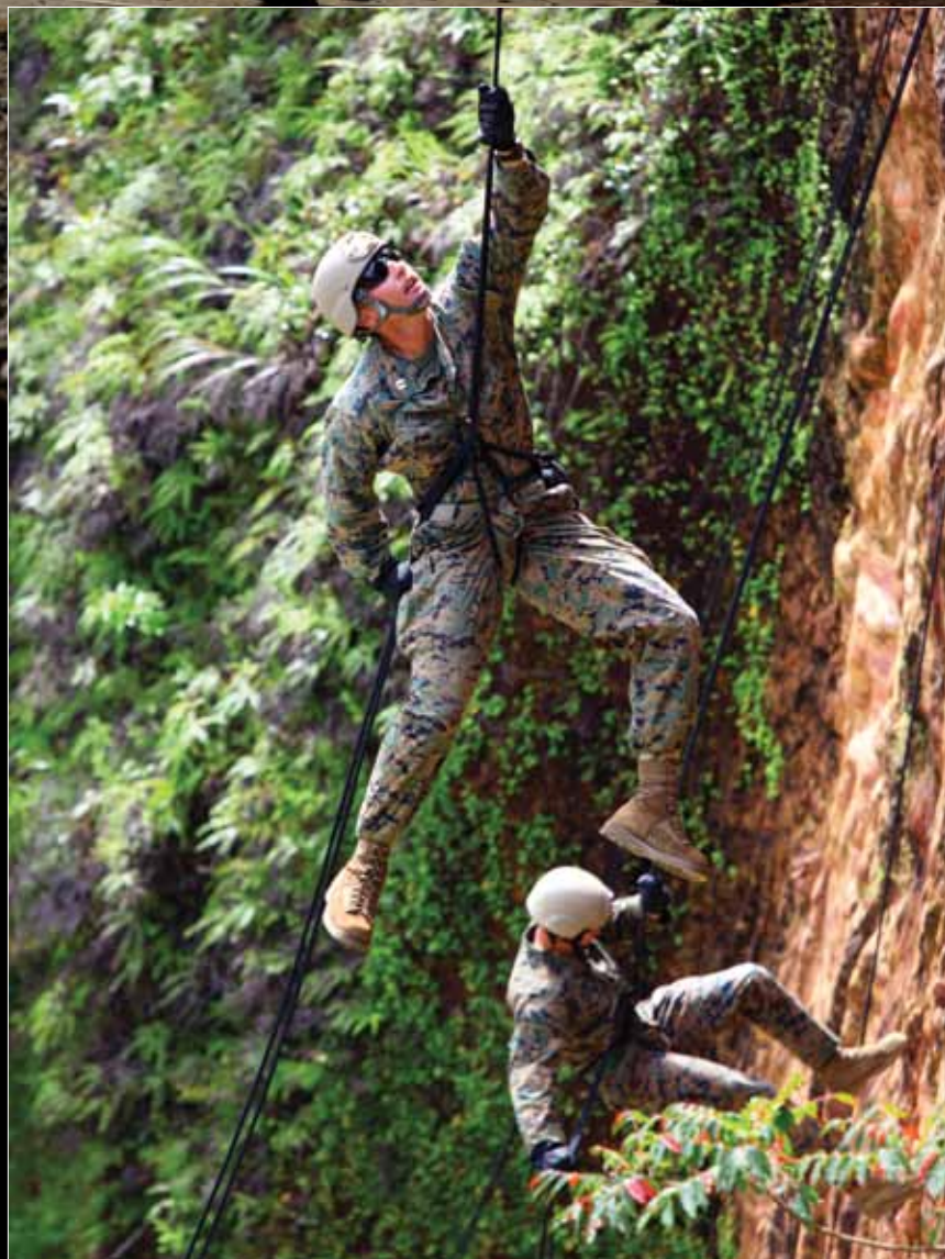
Reconnaissance Marines execute rappelling and fast-rope techniques at the Jungle Warfare Training Center at Camp Gonsalves July 25, 2012. The Marines are with Force Company, 3rd Recon Bn.