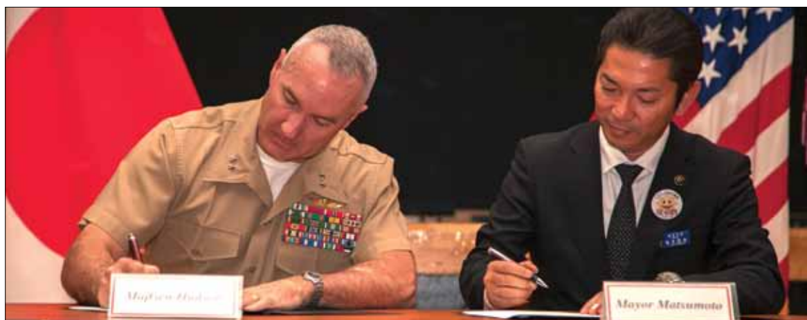
Mayor Tetsuji Matsumoto and Maj. Gen. Charles L. Hudson sign a local implementation agreement Jan. 17 at Camp Kinser. Matsumoto is the mayor of Urasoe City. Hudson is the commanding general of Marine Corps Installations Pacific and Marine Corps Base Camp Smedley D. Butler.