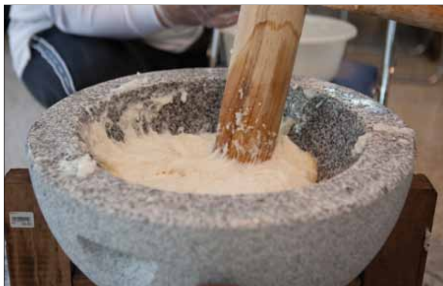
Rice is pounded into a paste-like consistency as part of an annual Mochitsuki Festival Jan. 17 at the Hikarigaoka nursing home in Kin Town. In the ceremony, a special type of white, sticky sweet rice is hammered with a mallet until the grains turn into paste.

The staff then scooped the pounded rice into a container where it was mixed with white