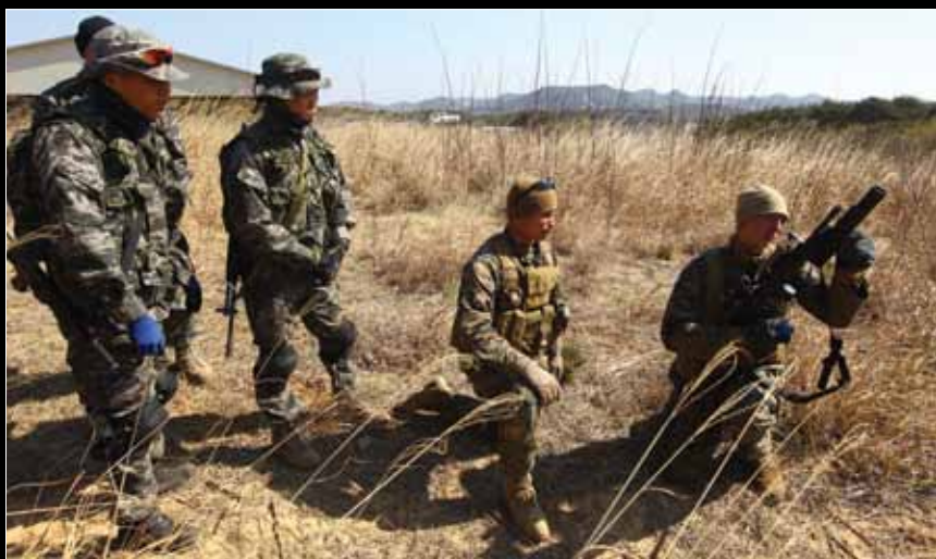
U.S. Marines with Company A, 3rd Recon Bn., explain the operation of the M203 grenade launcher to Republic of Korea Marines April 11, 2013 in the Republic of Korea during Exercise Ssang Yong 13.