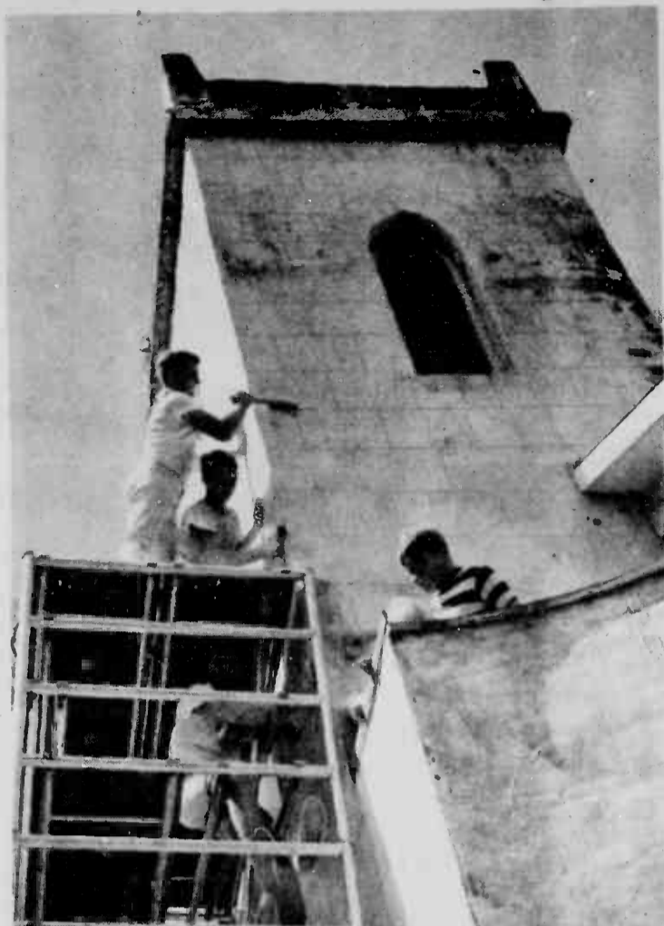
THE BEGINNING - Marines mount scaffolding to wire brush Father Damien's chapel in preparation to repainting.

Every Marine, certainly will profit from his personal experience at the settlement. It is hoped that the patients will be able to point with greater pride to Father Damien's Chapel. But most important, that his chapel will be a fitting tribute for one, who, as his epitaph at the church-side grave states, "Died a Martyr to the Charity for the afflicted Lepers."