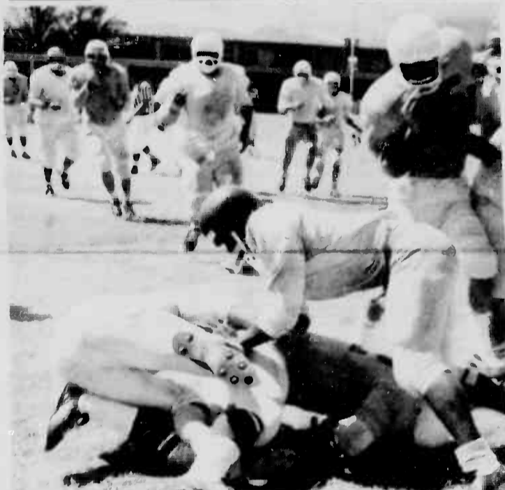
BITING THE DUST - Here's the Varsity in action again. The going gets tough as one of the halfbacks runs into some unfriendly territory.