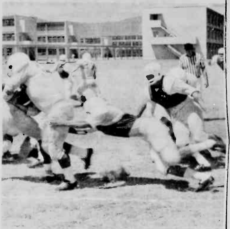
BREAKING AWAY - One of K-Bay's varsity players get's a nice block and heads for the clear in last Saturday's intersquad game. Team drills have been stepped up all week in preparation for tomorrow's game with the University of Hawaii.

Oct. 19, Marines vs Hauula Hawks - Hawks Field 2 p.m. Nov. 8, Marines vs U of Hawaii - U of Hawaii Field 2 p.m.