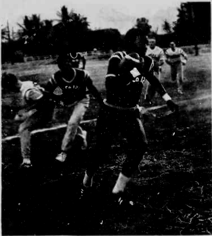
BIG SWEEP - A Delta Co. halfback races around Disbursing's left end, but to no avail as the Paymen pulled off their fourth straight win, 18-13.

This past week the intramural football scene saw MABS-24 continue their high-scoring shut-out wins with victories over "W" Battery, 71-0, and "A" Co., 42-0.