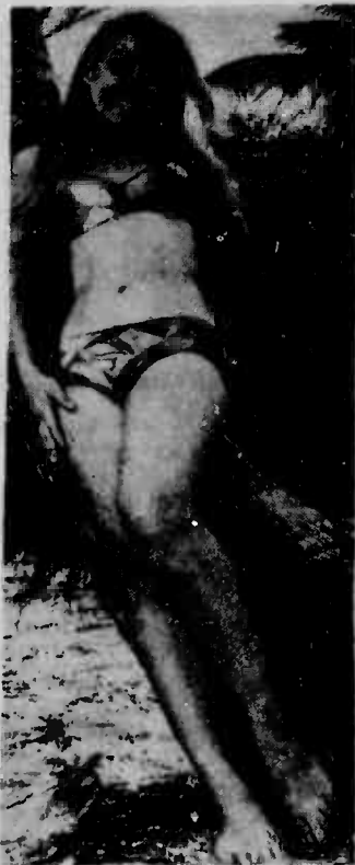
"GEEV 'EM!" - Windy's Wahine of the week says "SUCK 'EM UP DEVILDOGS!"

THURSDAY: MESSHALL 1 - Lunch - Corn beef on rye, chicken salad, german cole slaw, potato salad. MESSHALL 2 - Lunch - BBQ franks, home fries, strawberry shortcake w/whipped cream. Supper - steaks, baked potato, asst'd salads, hot apple pie.