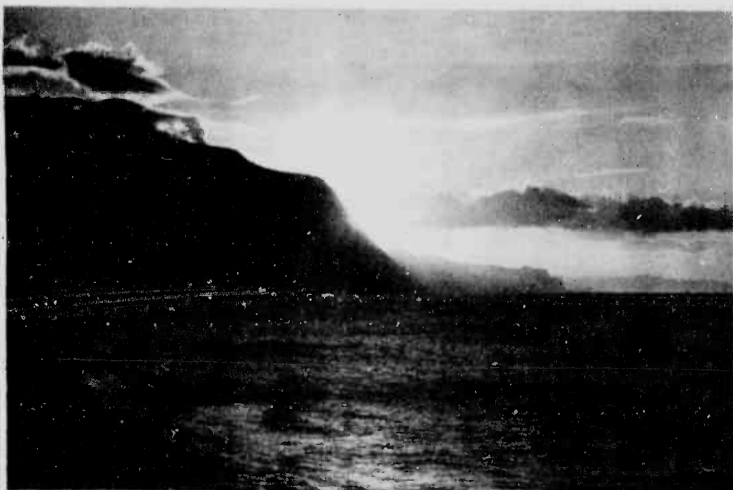
THE END OF DAY - Weary Marines, returning from their work on the chapel, are greeted by the silent splendor of the sun sliding behind the cliffs of Molokai.