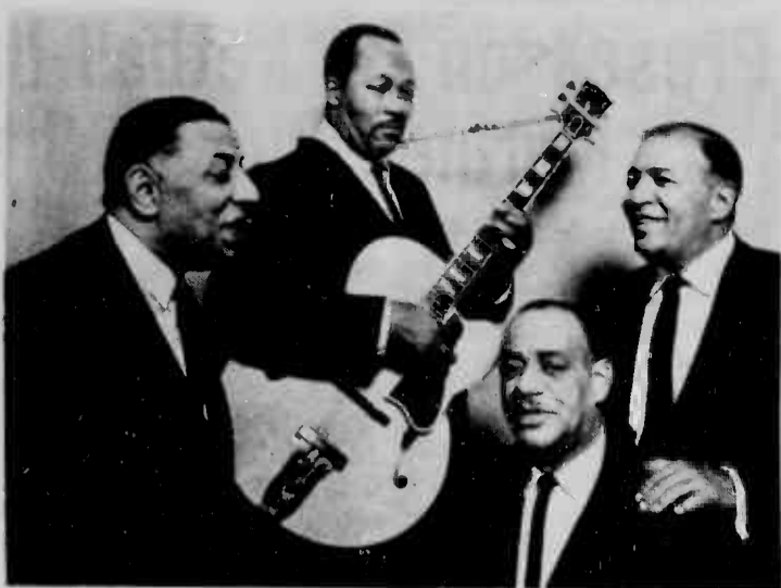
THE MILLS BROTHERS