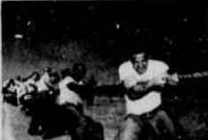
'Top Squad' Dines on 3-4

It doesn't seem to be getting clipped — hours were cut — at least at the Shop in K-Bay.