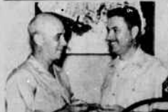
Patio Barber Shop 'Trims' Hours, Room