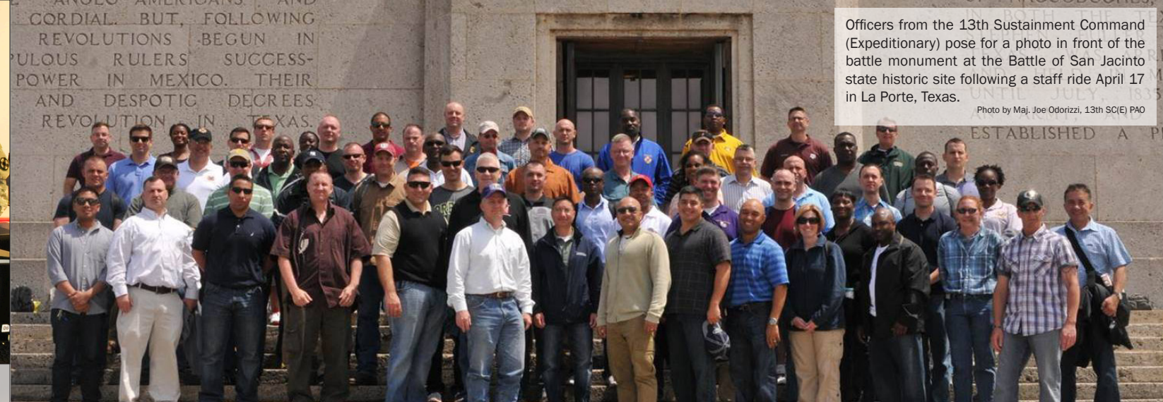
Officers from the 13th Sustainment Command (Expeditionary) pose for a photo in front of the battle monument at the Battle of San Jacinto state historic site following a staff ride April 17 in La Porte, Texas.