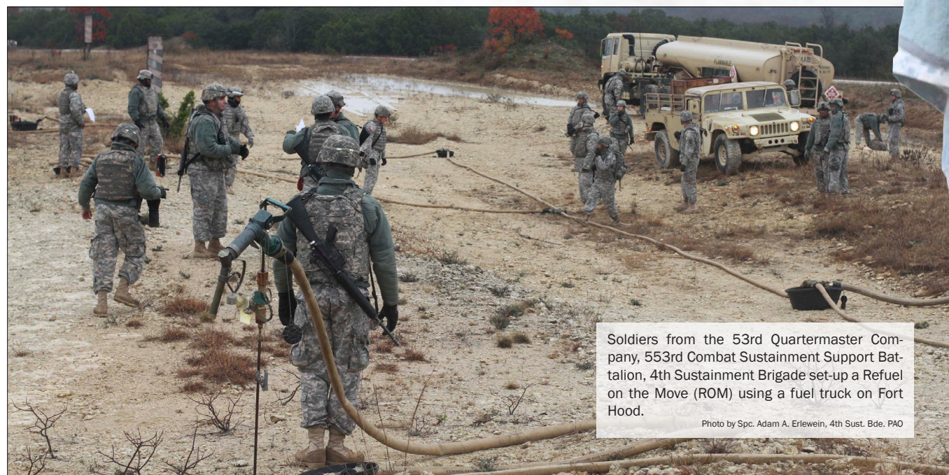
Soldiers from the 53rd Quartermaster Company, 553rd Combat Sustainment Support Battalion, 4th Sustainment Brigade set-up a Refuel on the Move (ROM) using a fuel truck on Fort Hood.