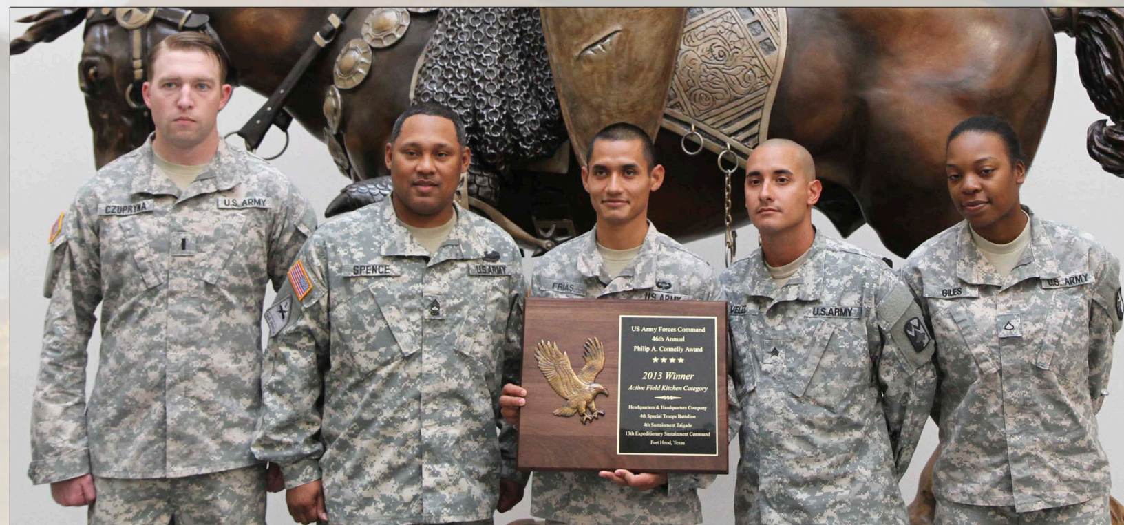
The first place award for the United States Army Forces Command 46th annual Philip A. Connelly competition was presented to Wrangler Soldiers from the 4th Special Troops Battalion, 4th Sustainment Brigade during an award ceremony at the III Corps Headquarters Building April 22, 2014. The Connelly award is one of the highest awards to be earned in food service.