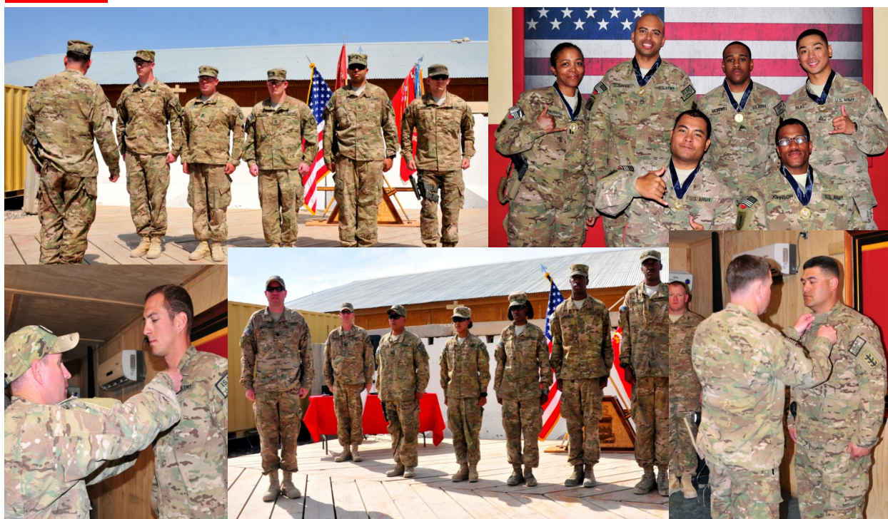
TF Bayonet Soldier and NCO of the Quarter