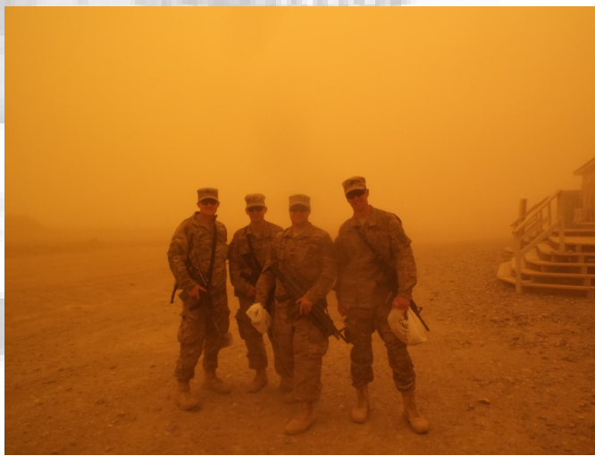
Soldiers from 2/849 taking in their first dust storm at FOB Spin Boldak