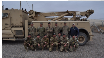
FMT after training the Italian Army on Recovery Operations

Unique to this deployment from most others that Soldiers within the company have experienced, every aspect of our operations involved multi-national support. Mission