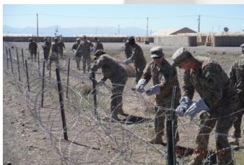
RCP68 constructing a wire obstacle

2nd Platoon (RCP68) during the first portion of the deployment primarily operated to the south of our area of