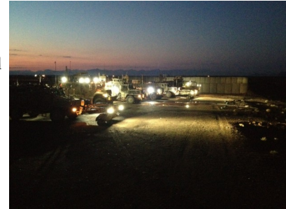
RCP57 staged prior to a mission

Last but definitely not least, 3rd Platoon (RCP57) started the deployment at a sprint when called on to support the U.S. Consulate following a devastating attack. First on the scene, RCP57 secured the area and reinforced vital force protection measures mitigating further risk. RCP57 also traveled to the northern most limit of the company's area of operation. Tasked with supporting units assessing the capabilities of the Afghan Border Police, RCP57 cleared the way to a successful mission, pushing the limits of the unit's capabilities and employing most of the company's enablers.