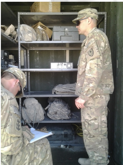
HQ Soldier's conducting inventory ensuring accuracy of property book in support of retrograde operations.