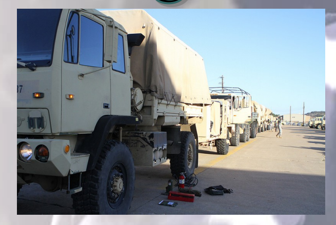
589th BSB motor pool move