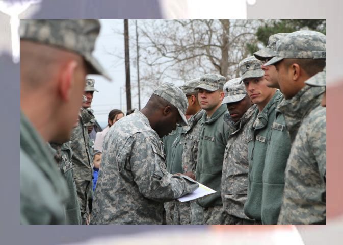
2-20th FAR departs for NTC