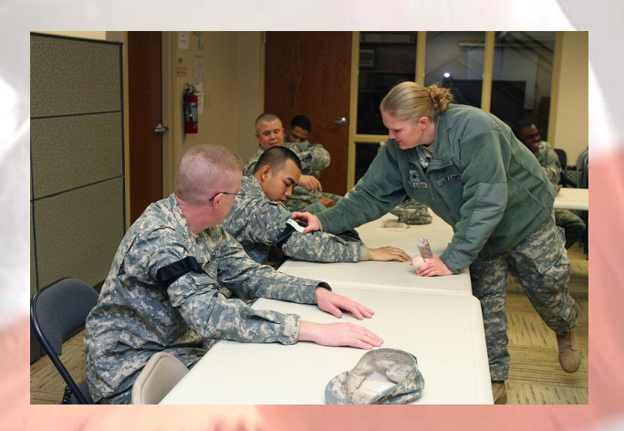
Tactical Combat Casualty Care