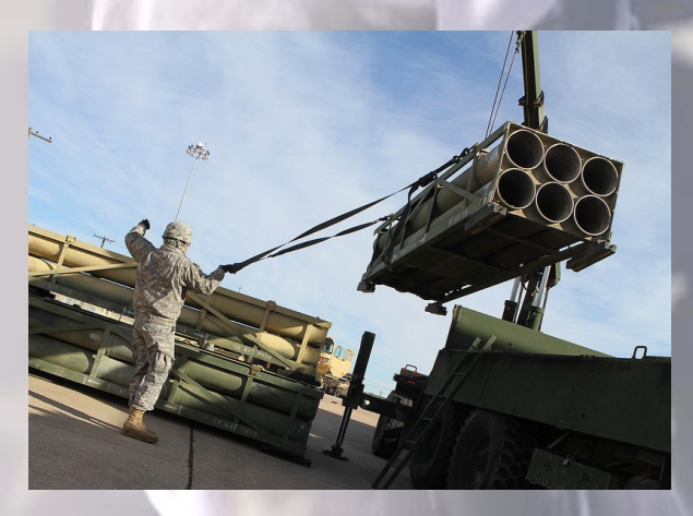
2-20th FAR Railhead operations