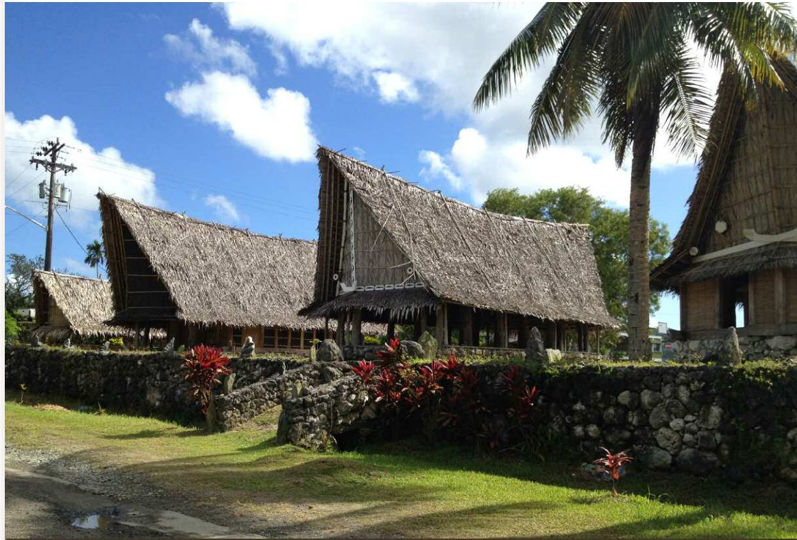
Above, rows of thatched roof buildings constructed of dried palm fronds at the Yap State Historic Preservation Office. The island of Yap is one of four island states that make up the Federated States of Micronesia. Lower right, large doughnut shaped stone money (Rai), unique to the island of Yap. -17 November 2013, photo by LCDR Aja Kirksey, USCG.

Among other duties, Task Force Representatives participate in U.S. Embassy country team meetings and conferences to ensure synchronization of JIATF West activities with U.S. government partners. This meeting was an ideal Task Force Representative engagement opportunity, and will inform future engagements in Oceania to include facilitating a national biometrics database assessment with the FSM National Government, and potential engagement with the Micronesia Transnational Crime Unit in Pohnpei, FSM. Prior to the JCM, on the 17th of November, both delegations from the FSM