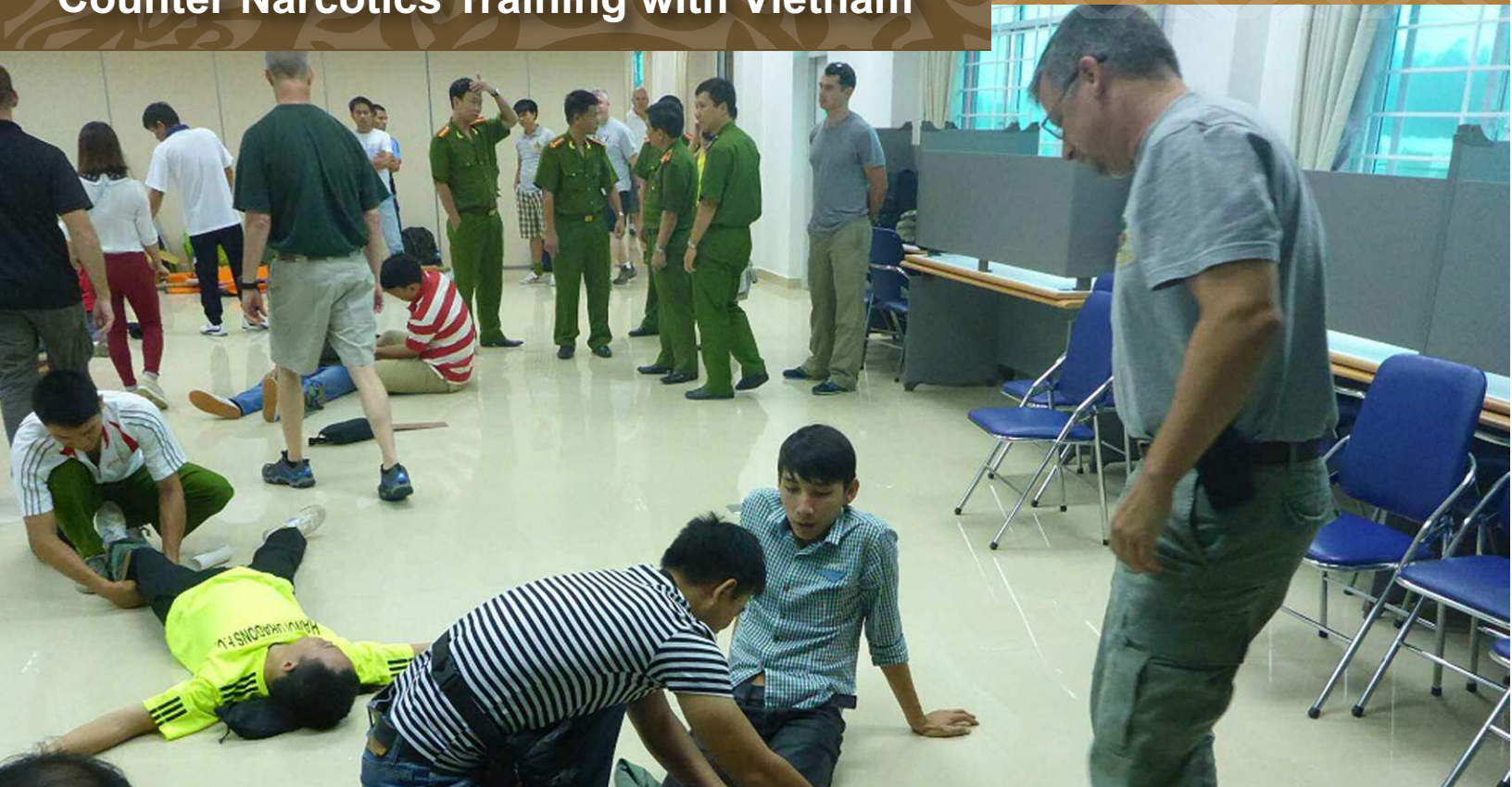
A US Army instructor observes police officers practicing tactical combat casualty care techniques during an 11 day tactical training course in Vietnam. – 11 September 2013.

The June training took place between the 10th and the 21st and covered two main topics. The first week concentrated on the basics of field medicine and tactical combat casualty care, while the second week focused on law enforcement techniques. Areas of law enforcement covered suspect apprehension, handcuffing, self defense, tactical safety, entry procedures, and operation planning. Three Marine and two Navy Corpsman provided the field medical training during the first week and three DEA Special Agents covered law enforcement.