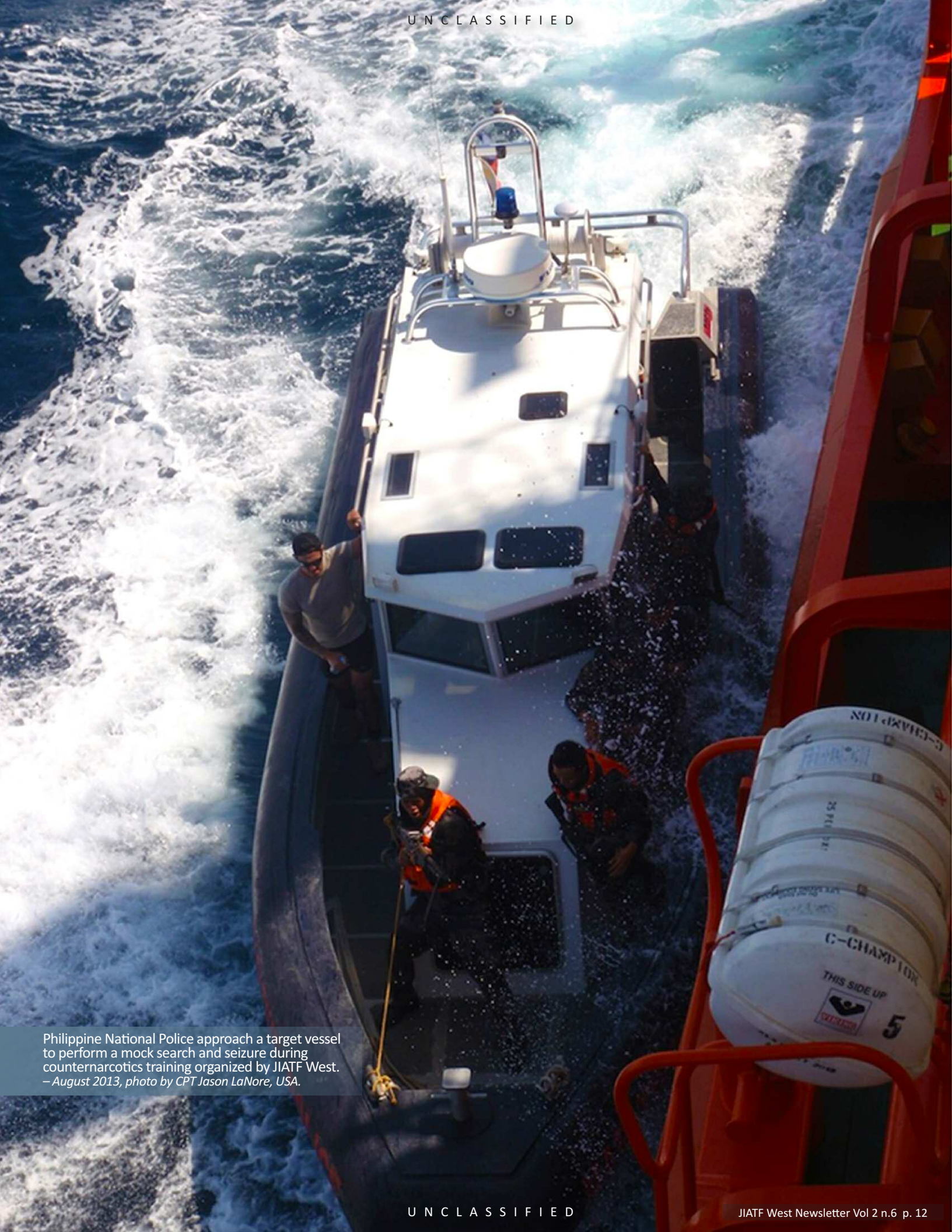
Philippine National Police approach a target vessel to perform a mock search and seizure during counternarcotics training organized by JIATF West. – August 2013, photo by CPT Jason LaNore, USA.