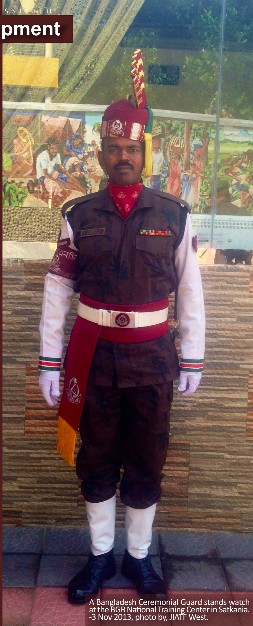
A Bangladesh Ceremonial Guard stands watch at the BGB National Training Center in Satkania. -3 Nov 2013, photo by, JIATF West.

From the assessment, JIATF West will draft a mutually supported infrastructure concept of operations. The Law Enforcement Agency sponsor for projects is the International Criminal Investigative Training Assistance Program (ICITAP) and all projects will be implemented with the approval and coordination of the US Embassy’s Office of Defense Cooperation (ODC). During 2014, Director of JIATF West, RDML James Rendon, USCG will personally travel to Bangladesh to sign documents that will allow for the implementation of the approved infrastructure projects. --