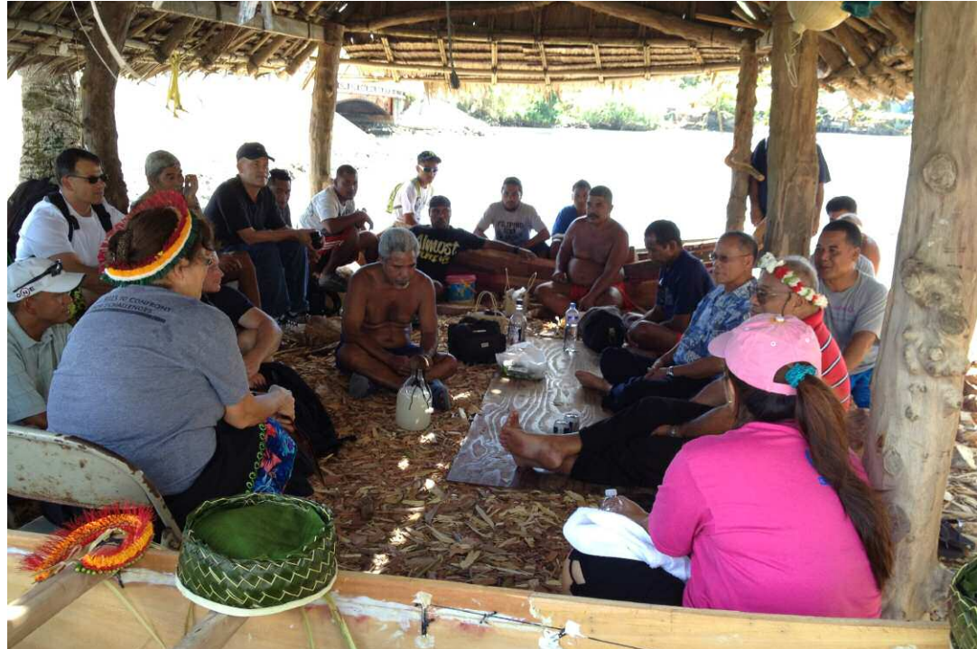
Above, Delegation members participating in a Wa'gay ceremony; recognizing those local members excelling in traditional canoe-making, and sharing in the traditional drink tuba, or the fermented sap of the coconut palm. Below, a traditional ocean canoe typically used for transportation around Yap. -17 November 2013