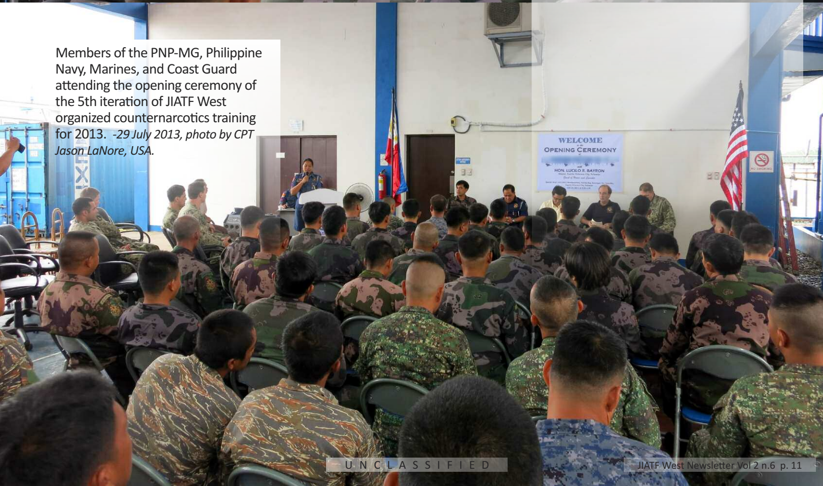
Members of the PNP-MG, Philippine Navy, Marines, and Coast Guard attending the opening ceremony of the 5th iteration of JIATF West organized counternarcotics training for 2013. -29 July 2013

Above, children at a local orphanage sing a song of gratitude for the supplies donated by US military trainers.