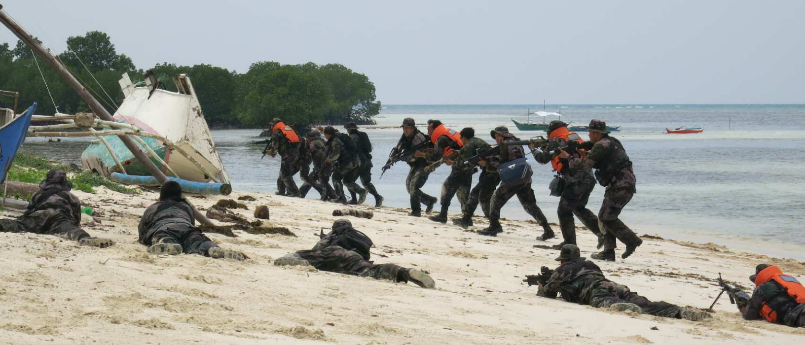
Philippine Maritime Police rehearse tactical maneuvers on a beach as part of a culmination exercise after a month of counternarcotics training organized by JIATF West. -25 September 2013. Below, US Military Trainers underway with Philippine Maritime Police during a JIATF West organized CNT event in the provincial region of Palawan. -5 August 2013.

Several iterations of JIATF West organized follow-on counternarcotics training were conducted in 2013 to support maritime security force units in the Philippines. This article covers the events of two of them. Iteration 5, which took place from 29 July to 23 August, 2013, and iteration 6, which took place 2-23 September, 2013.