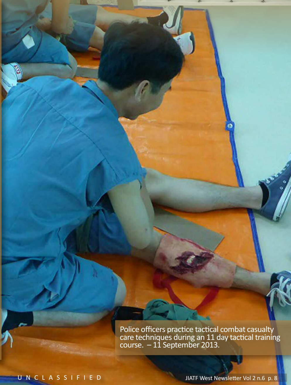
Police officers practice tactical combat casualty care techniques during an 11 day tactical training course. – 11 September 2013.