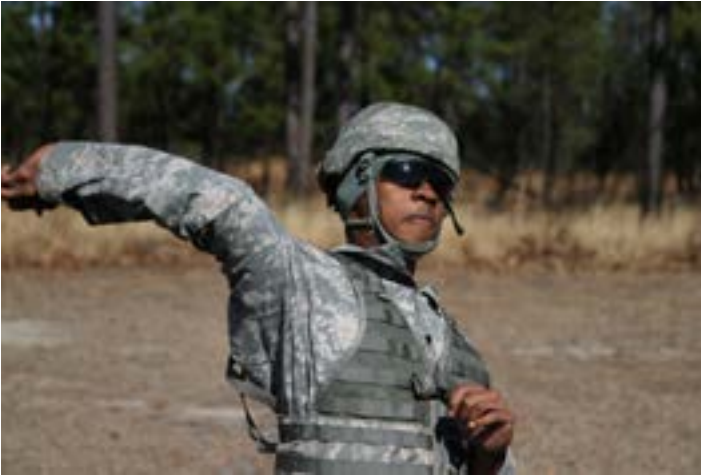
Soldiers of Headquarters Headquarters Battery, 18th Fires Brigade held a grenade range Jan. 27. The range qualified Soldiers on live hand grenades.