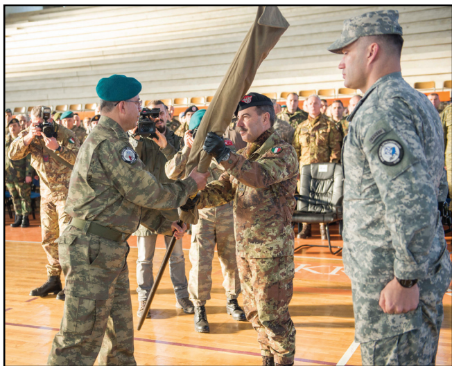
JRD-E, JRD-S CONDUCT MERGER CEREMONY PG 11