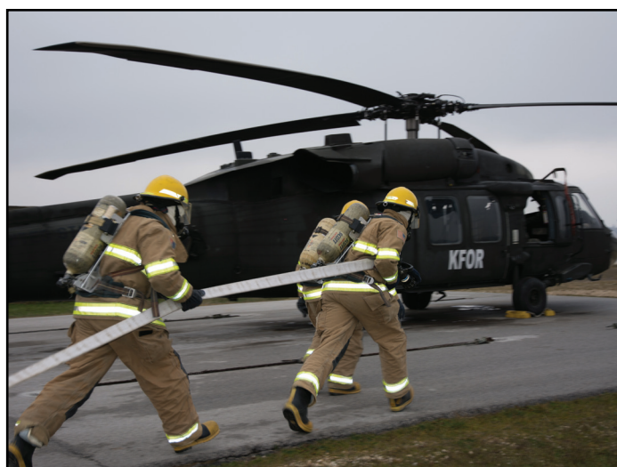
JOINT EMERGENCY TRAINING PG 18