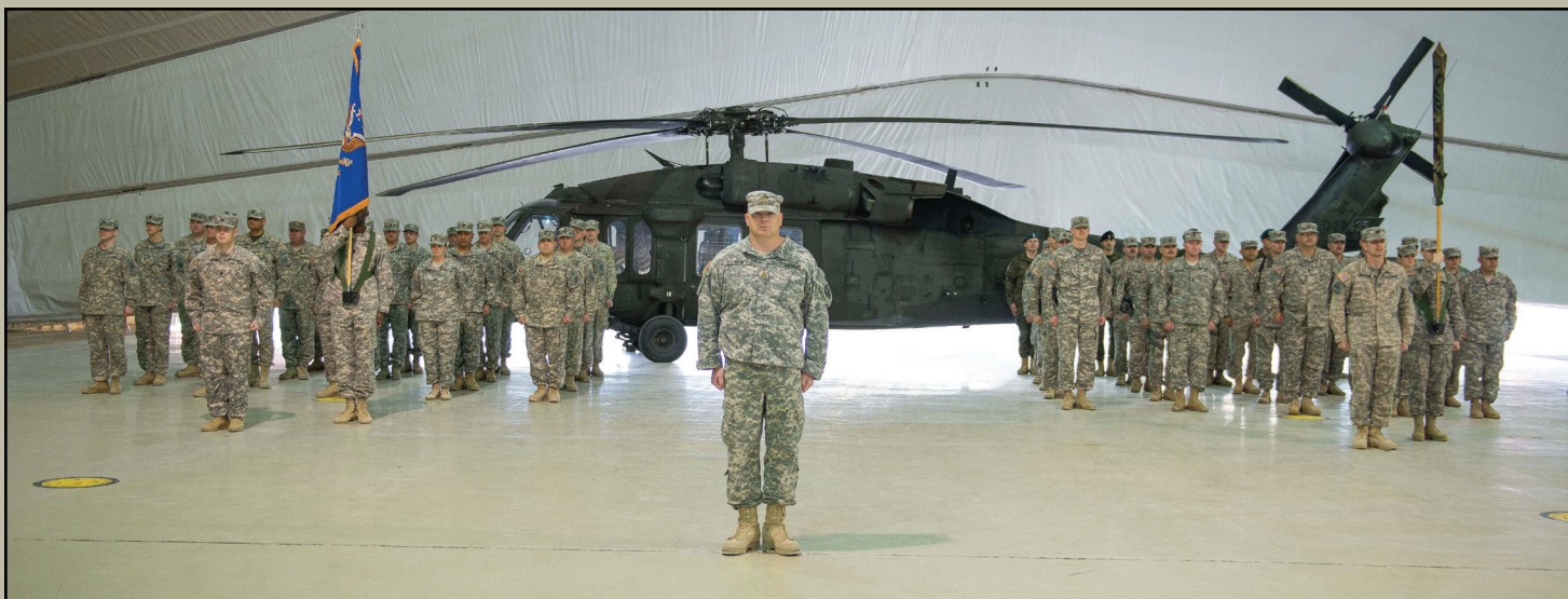
Task Force Phalanx and Task Force Warhorse stand at attention during the transfer of authority ceremony at Camp Bondsteel Jan. 20. TF Phalanx, Kosovo Force 17, was comprised of more than 400 coalition partners and four National Guard units.