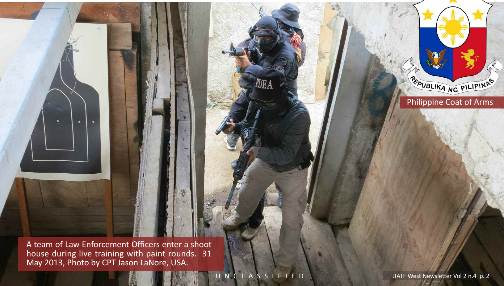
A team of Law Enforcement Officers enter a shoot house during live training with paint rounds. 31 May 2013, Photo by CPT Jason LaNore, USA.