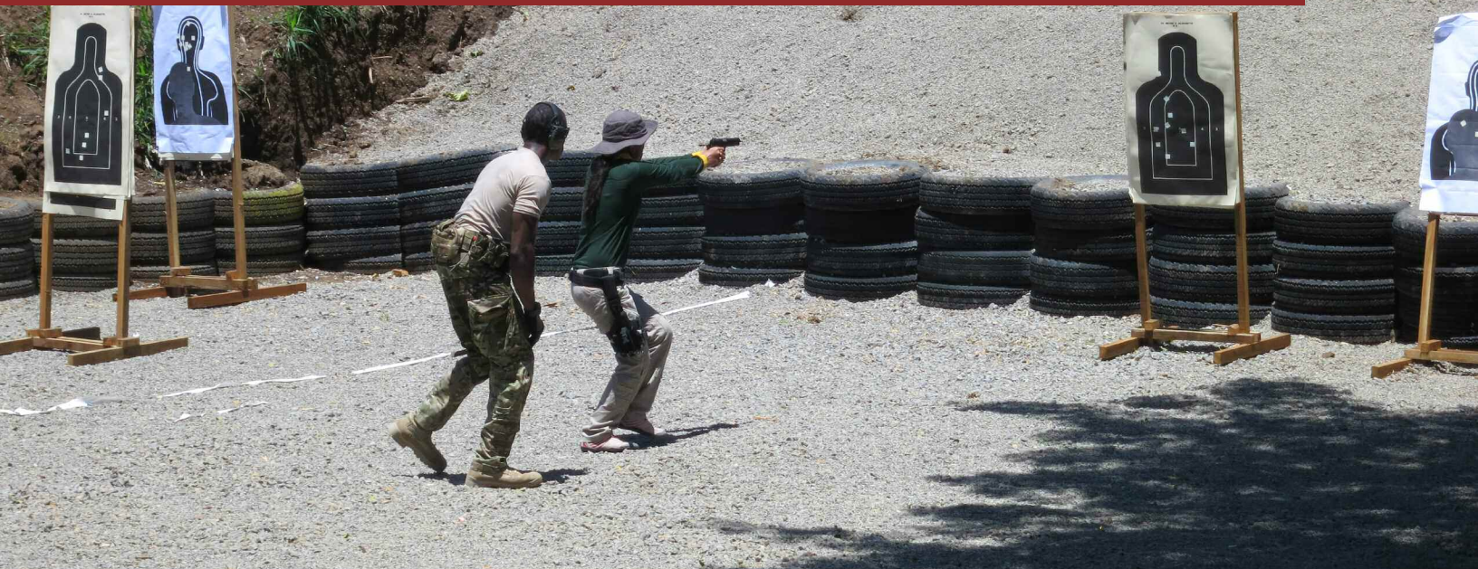
A U. S. Army Instructor follows a Philippine Law Enforcement Officer during a “walking and shooting” practice run as part of a stress shoot course. Below, a tunnel crawl-through as part of the stress shoot course. -29 May 2013