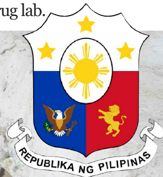
Philippine Coat of Arms