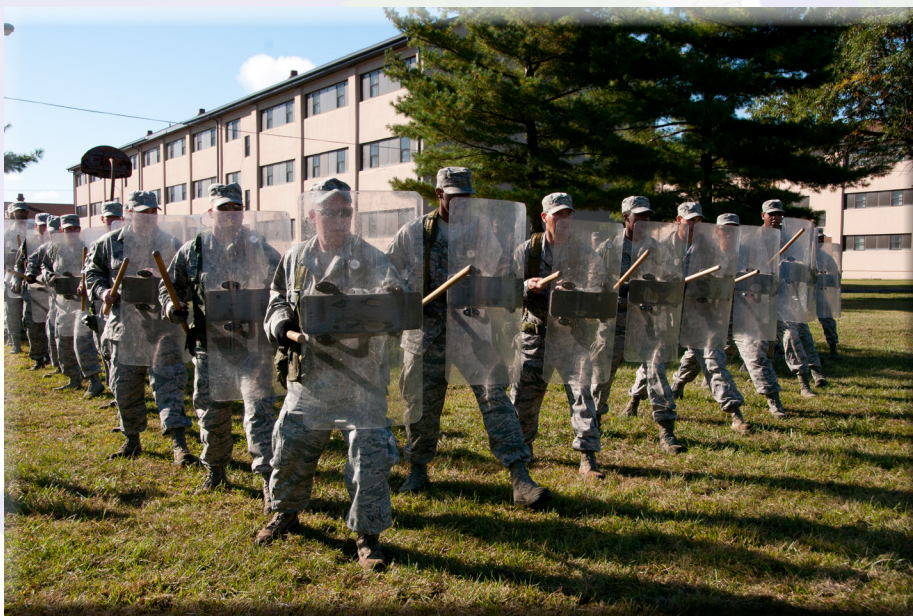
Members of the 108th Wing and 177th Fighter Wing participate in the annual Quick Response Force (QRF) training September 29, 2013, at Joint Base McGuire Dix Lakehurst, N.J. QRF training taught members how to deal with various civil disturbances.

QRF has enabled our forces to be more resilient and able to adapt to more situations. It has taught our members skills necessary to handle devastating events, such as Sandy and that's what some of these Guard members did almost a year ago.