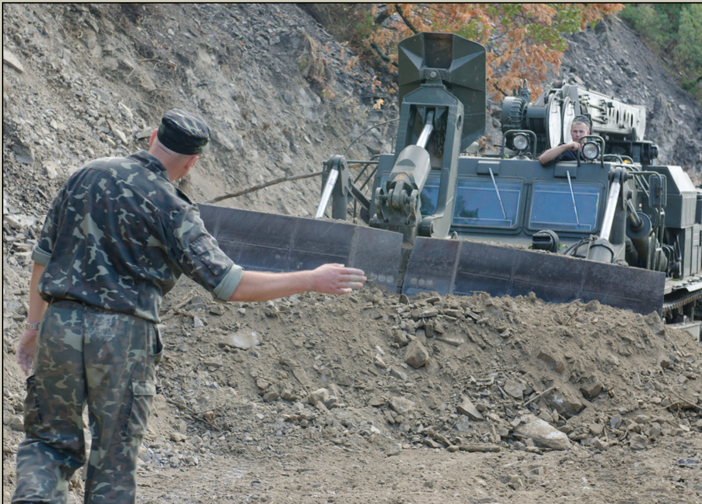
A member of the Ukrainian engineers, from the Joint Logistics Support Group, helps guide a heavy vehicle during the clearing of a landslide on a road outside Zubin Potok Sept. 11. Several Kosovo Forces units were involved in the clearing operation.