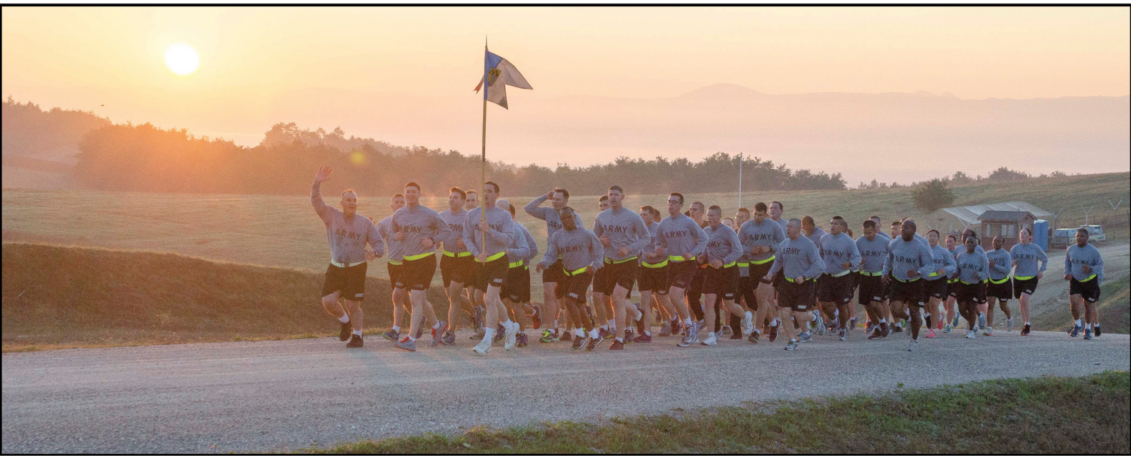
The 525th Battlefield Surveillance Brigade Headquarters and Headquarters Company hosted a day of sports, grilling and morale building for its soldiers with Multinational Battle Group-East at Camp Bondsteel Sept. 21.