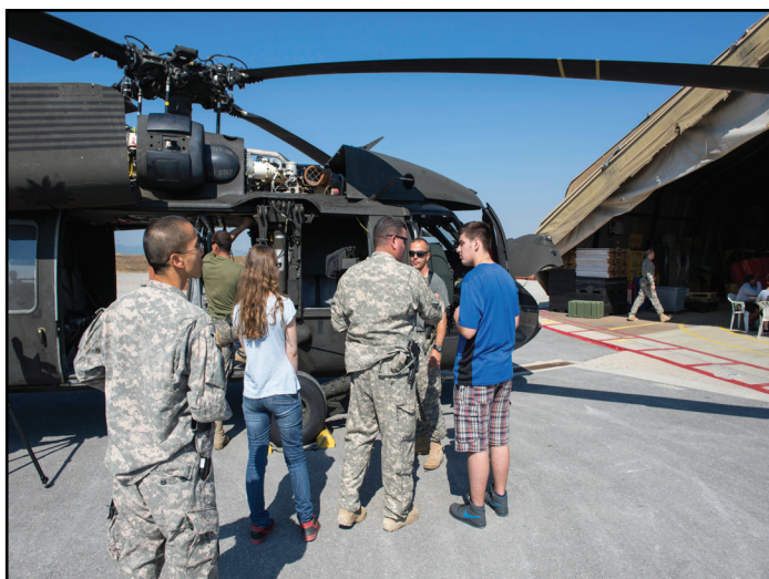
TOEFL STUDENTS VISIT WAFFLE HOUSE PG 26