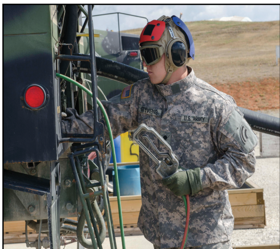
FARP KEEPS TF AVIATION FUELED AND FUNCTIONING PG 16