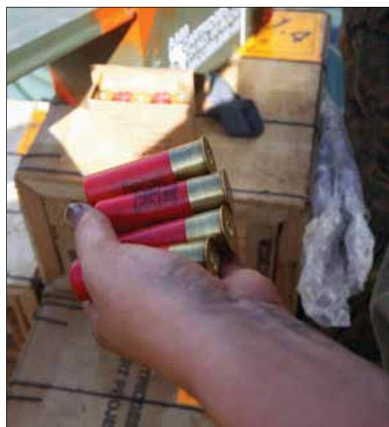
A Marine examines 12-gauge shotgun shells during a field ammunition supply point exercise Sept. 18 at Landing Zone Dodo in the Central Training Area. The Marine is with Ammunition Co.