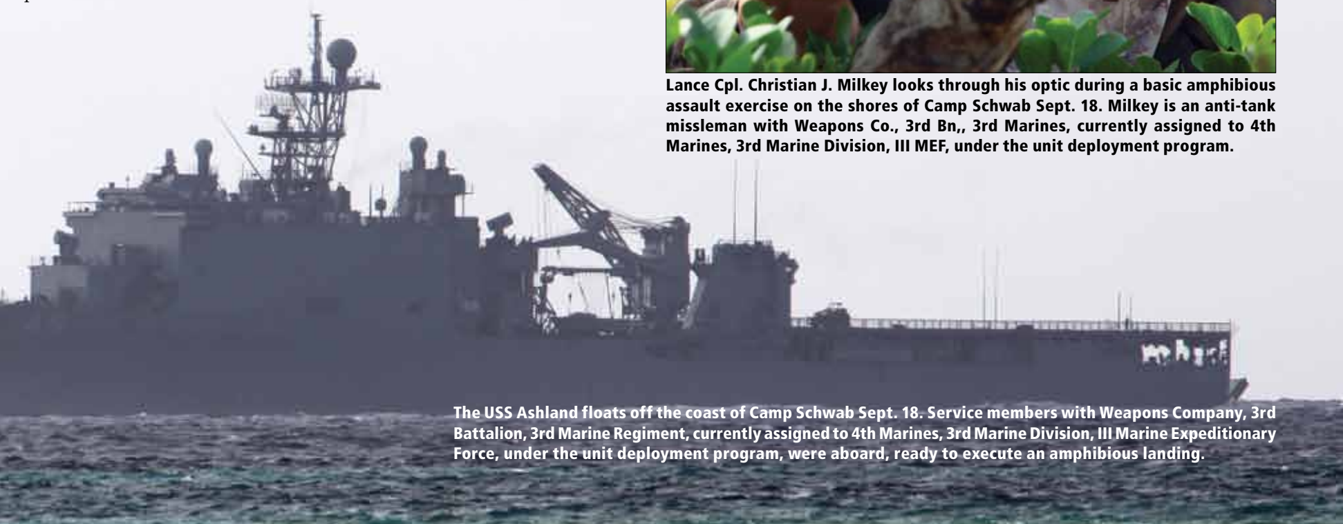
The USS Ashland floats off the coast of Camp Schwab Sept. 18. Service members with Weapons Company, 3rd Battalion, 3rd Marine Regiment, currently assigned to 4th Marines, 3rd Marine Division, III Marine Expeditionary Force, under the unit deployment program, were aboard, ready to execute an amphibious landing.

h assault Sept. 18 along the Camp Schwab with Weapons Company, 3rd Bn., 3rd Marines, eapons Co., 3rd Bn., 3rd Marines, is currently under the unit deployment program. The AAVs bat Assault Bn., 3rd Marine Division, III MEF.