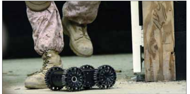
An operator demonstrates a Stingray Micro Unmanned Ground Vehicle's capabilities Sept. 18 at Camp Hansen.

This prototype can aid in missions which require ground forces to search an