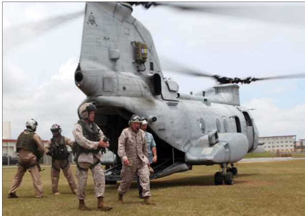
Gen. James F. Amos, center, exits the back of a CH-46E Sea Knight helicopter July 18 at Camp Hansen, where Amos spent time speaking with service members. Amos is the commandant of the Marine Corps and a member of the Joint Chiefs of Staff.

"The suggestion that in an era of sequestration Marines simply 'go back to sea' ignores the fact that Marines never left the sea."