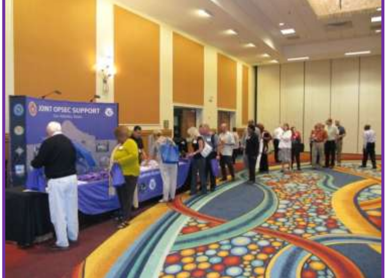
Joint OPSEC Support Element booth at the 2012 National OPSEC Conference

At the end of the day, active engagement amongst fellow OPSEC professionals exchanging best practices and lessonslearned was the most important aspect of the