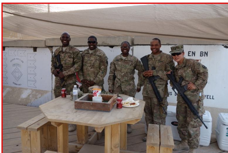
Soldiers from Forward Support Company and Headquarters and Headquarters Company find some time to enjoy themselves in between all of their hard work.