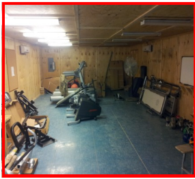
The Task Force Iron Fist Gym before the new equipment.

“CHAOS Soldiers continue to physically prepare for the Company’s October 22nd and 23rd Army Physical Fitness Test, but more importantly, for their Families awaiting them in the United States!”