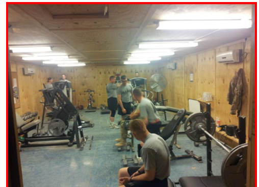
The Task Force Iron Fist Gym in use. Soldiers take advantage of the new equipment and the gym’s close proximity to work.