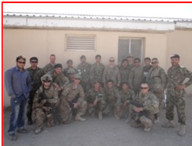
Soldiers of 372nd Engineer Company and the Afghan National Army Engineers, outside the literacy center construction project.

The ANA literacy center project is a culmination of months of training that was initiated by the 181st Eng. Co., Army National Guard. The 372nd Eng. Co. ANA Group looks forward to helping the ANA move forward with the final steps of the project, and to help them develop a method of training and instruction which sustains their skills as they move forward.