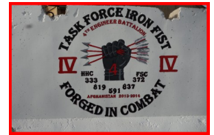
The Task Force Iron Fist logo posted outside of Battalion Headquarters.

The Soldiers of the 333rd Eng. Co. have been working extremely hard on their various projects and are seeing results.