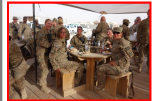
The Soldiers of both companies were able to relax and socialize with fellow Soldiers while enjoying a good, old-fashioned cookout.

However, these successes do not come without sacrifices. We owe all of our successes to our biggest supporters: the Families, friends, and loved ones of Forward Support Company Beast. So a big “thank you” to the ones who make all of this possible.