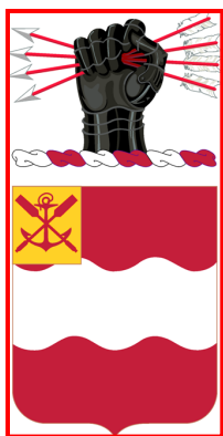
The Iron Fist Coat of Arms