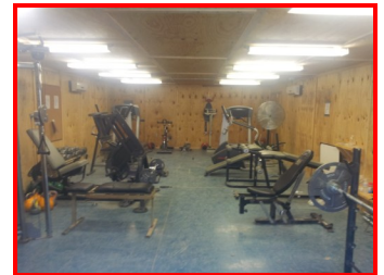
The Task Force Iron Fist Gym with the new equipment.

CHAOS Soldiers continue to physically prepare for the Company’s October 22nd and 23rd Army Physical Fitness Tests, but more importantly, for their Families awaiting them in the United States!