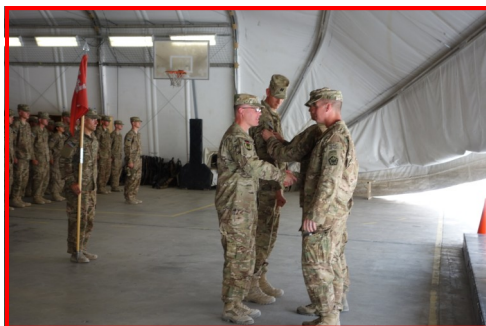
The Iron Fist Command Team places combat patches on the 372nd Eng. Co. Command Team.