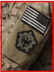
A Soldier from 4th Engineer Battalion, Task Force Iron Fist, wears a newly earned 555th Engineer Brigade.

"The combat patch is something Soldiers are authorized to wear every day until they leave the Army, which will remind them of their service to our nation at a time of war."