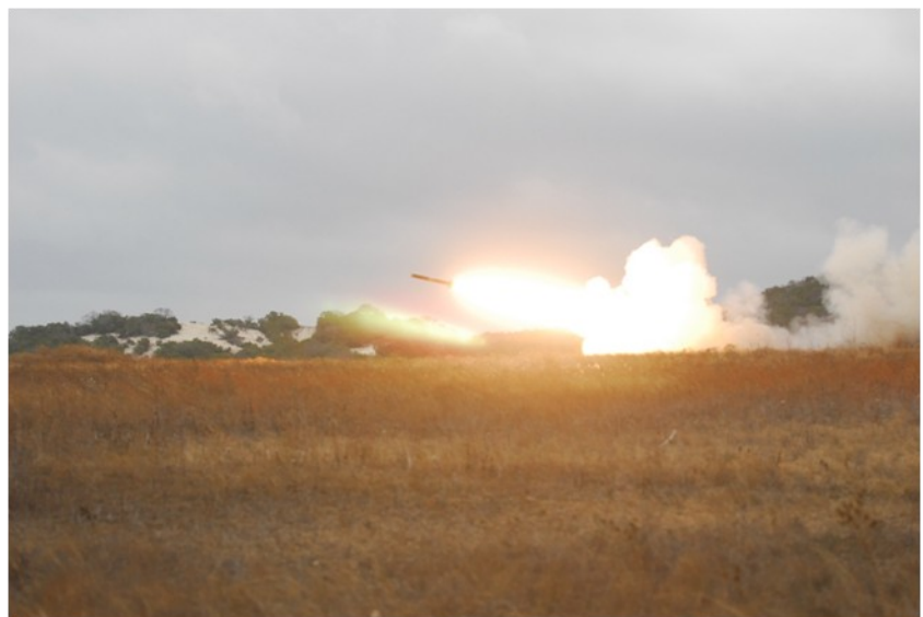
Soldiers from B Battery, 2nd Battalion, 20th Field Artillery Regiment, 41st Fires Brigade, participate in a live fire exercise at Fort Hood, Texas Jan. 29. The exercise was designed to qualify and certify each of the MLRS crews on their assigned weapon system. An MLRS crew must qualify once every six months to stay proficient.

The battery safely and successfully certified all crews during this exercise.