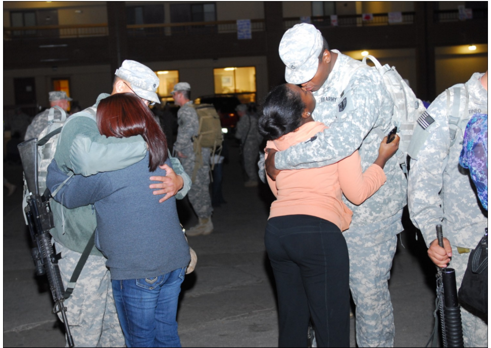
Soldiers for A Battery, 2nd Battalion, 20th Field Artillery Regiment, 41st Fires Brigade, give their final goodbyes to their spouses as the battery prepares to leave the battalion area and head to the airport Feb. 2.

All too soon it was time for the battery to load on to buses to depart the battalion area for the airport. Hugs and kisses were given quickly as Family members said their final goodbyes before the Soldiers got on the bus and soon after the airplane that will take them on their journey half-way around the world.