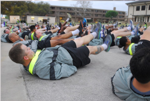
After 41st Fires Brigade run