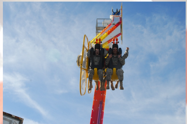
Houston Live Stock Show and Rodeo