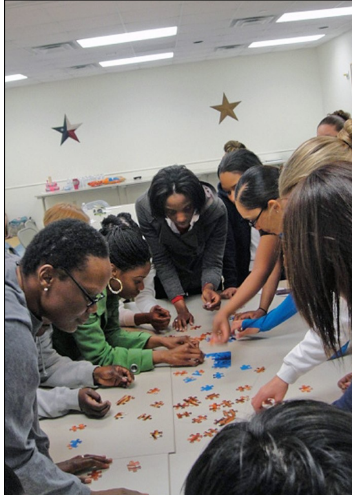
Female Soldiers with the 1st Battalion, 21st Field Artillery Regiment, 41st Fires Brigade, assemble a puzzle together as part of the battalion’s Women’s Mentorship Day March 25 at the Oveta Culp Center on Fort Hood.