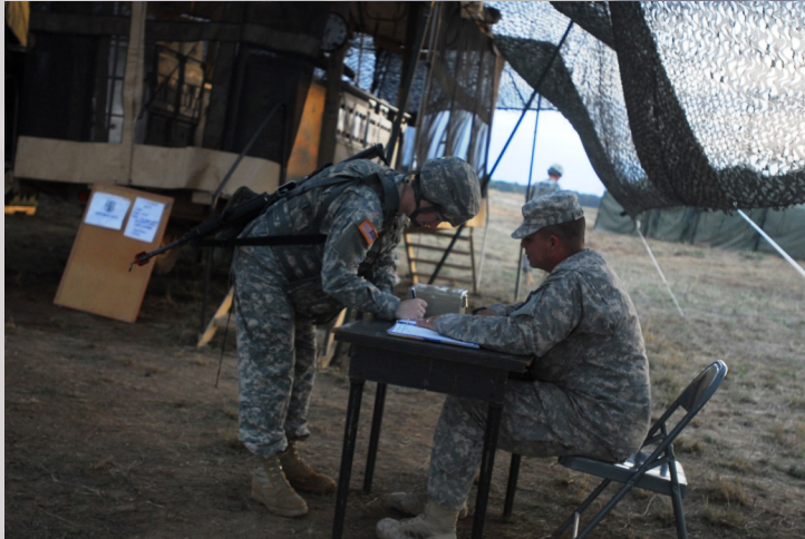
Philip A. Connelly Competition