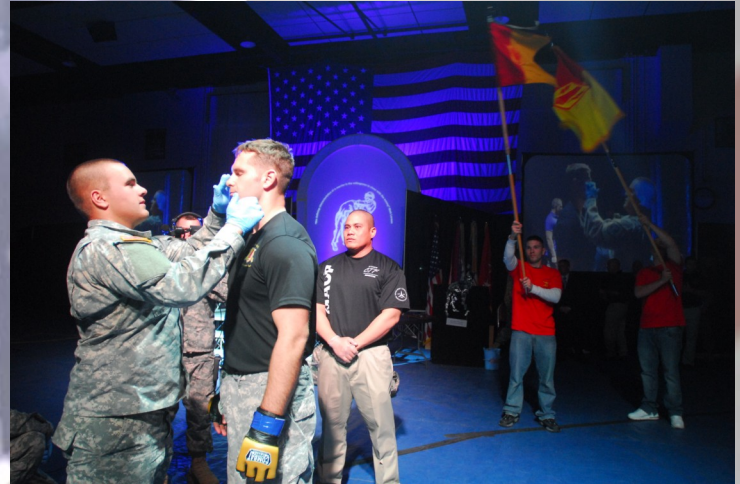
2013 Fort Hood Combatives Tournament