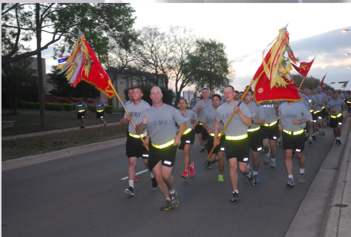
1st Cavalry Division run