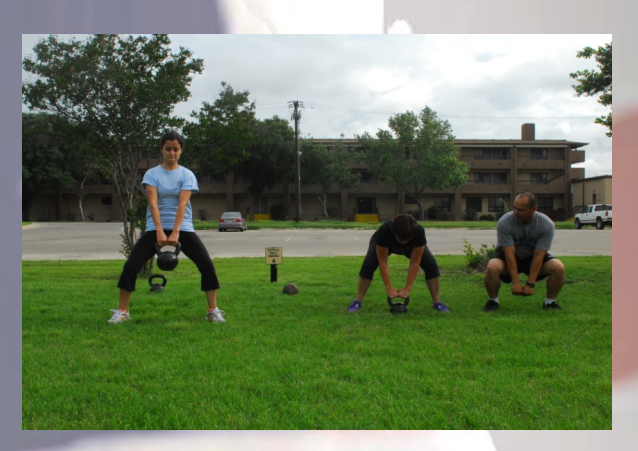
Spouse Blue Max Challenge