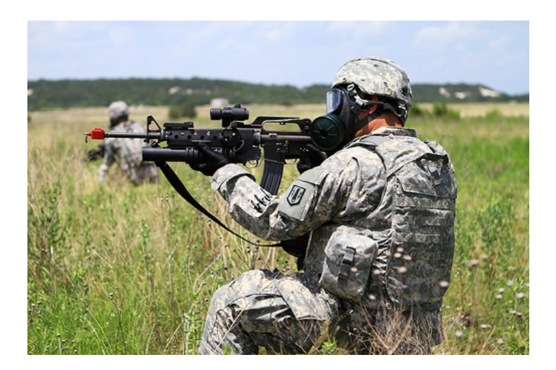
A Soldier from Headquarters and Headquarters Battery, 41st Fires Brigade, pulls security during the CBRN lane at the unit's field training at Fort Hood, Texas, June 19. Soldiers were trained on battle drills, CBRN, CASEVAC and other Common Soldier Tasks.