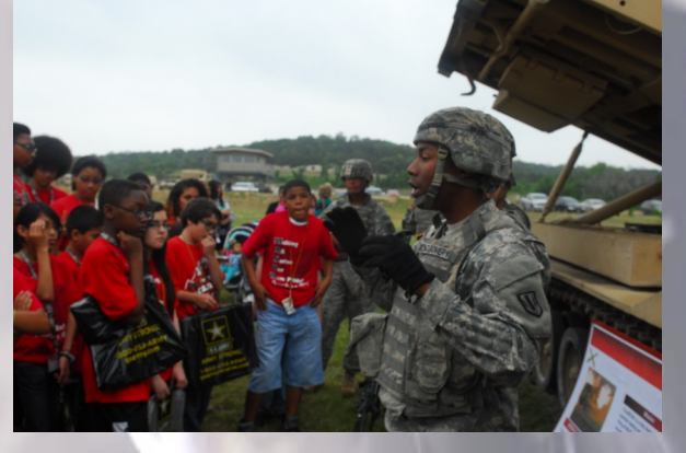
1-21 FAR Family and Friends Live Fire