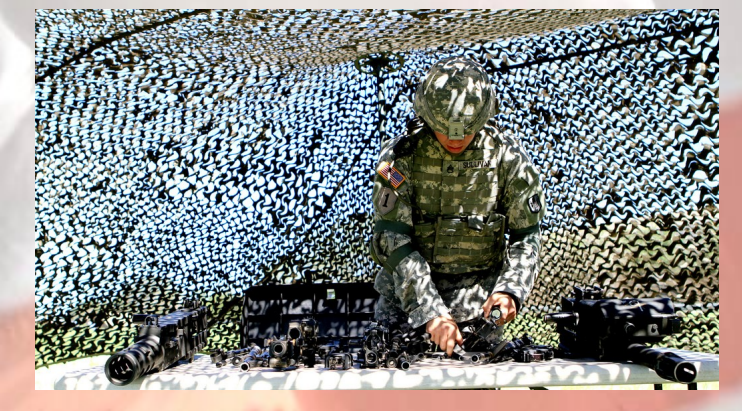
1st CAV Best Warrior Competition