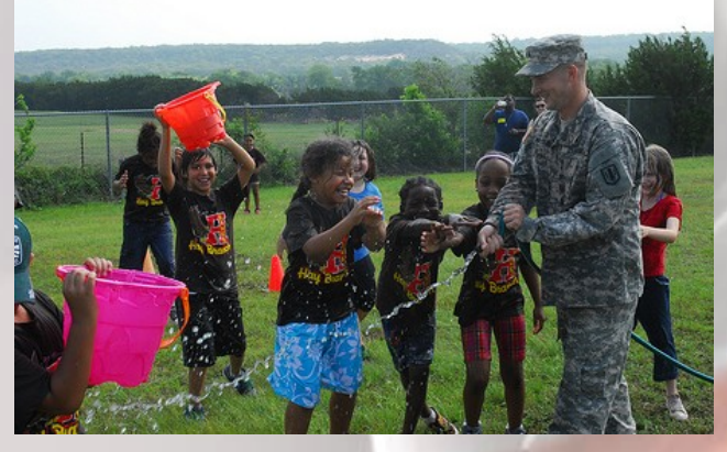
Hay Branch Elementary Field Day