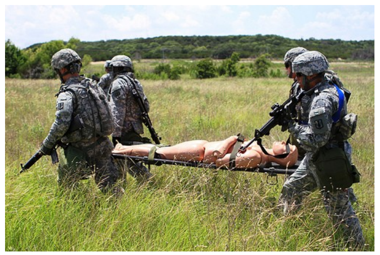
Soldiers from Headquarters and Headquarters Battery, 41st Fires Brigade, evacuate a simulated casualty during the CASEVAC lane at the unit's field training at Fort Hood, Texas, June 19. Soldiers were trained on battle drills, CBRN, CASEVAC and other Common Soldier Tasks.