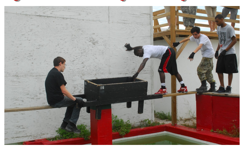
Teens work together to move a crate across a pool of water at Fort Hood's Leader Reaction Course, June 14, at the 41st Fires Brigade's 2nd Annual Teen Extreme Day. Teenage family members from across the brigade were given the opportunity to take part in some military training.

The day ended when the teens received thanks and a certificate from the 41st Fires Bde. leadership, Col.