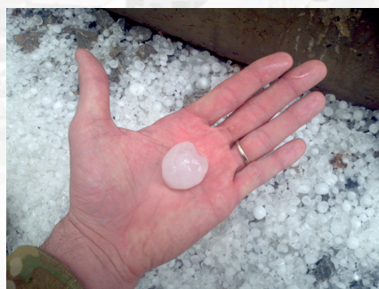
Chief Warrant Officer 2 Caleb Sharpe holds a piece of hail on Kandahar Airfield, Afghanistan April 23. The hail size was slightly larger than a golf ball causing damages to Task Force Falcon's fleet of helicopters parked on the flight line.

the globe orchestrating resupply efforts, resulting in over half of the damaged helicopters repaired in the first week. Within five days, nearly 25 percent of the blades had arrived for replacement.