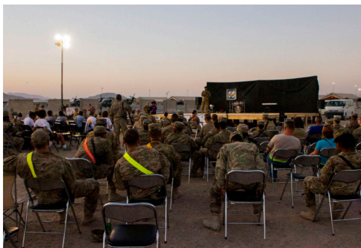
(Left) KAF personnel watch performances near Task Force Falcon headquarters.