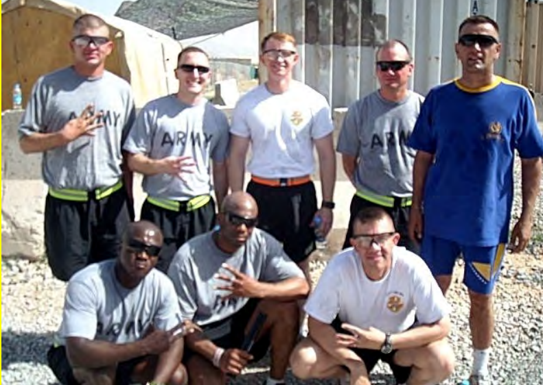
Team "Not so top heavy" poses for a group photo following the CTFC Marathon.

Soldiers and Family Members of the 115<sup>th</sup>