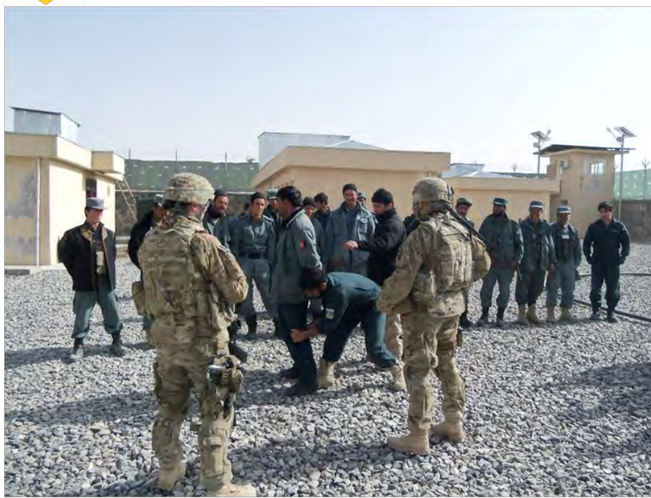
Soldiers teach AUP how to search a person under arrest

This last month, 6-1, 603<sup>rd</sup> MP CO went to PSS3. and conducted training with the AUP there on recognizing IED components, and some basic weapon handling. Then they returned to base. This simple mission, delayed for more than a week because of operational considerations, was a final step for the 603<sup>rd</sup>, and the last step for a long line of units. It was the final PMT mission to the Police Sub-Stations of Kandahar City.