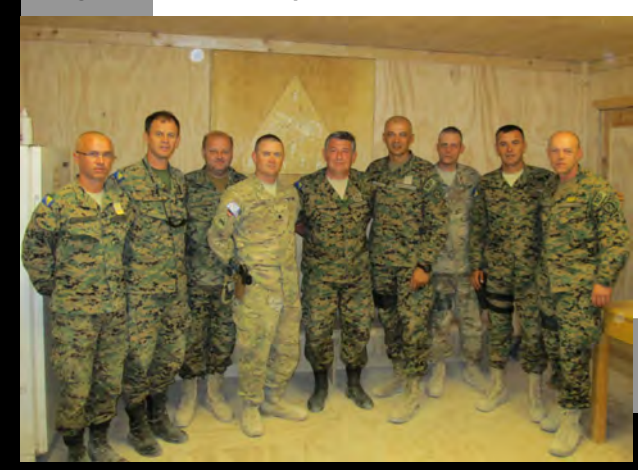
COL Radovan (BiH) visits deployed BiH Soldiers assigned to CTF Chesapeake.

Combat operations like the one pictured below are effective at disrupting enemy from conducting attacks in Kandahar City.