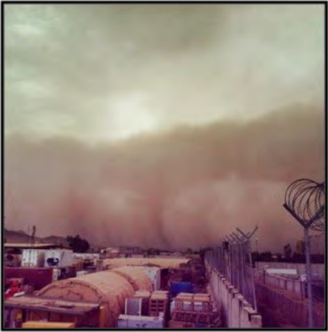
A sandstorm is approaching the base quickly – a wall of dust and sand!

The 153<sup>rd</sup> has had quite a high optempo recently,