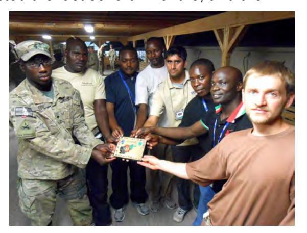
The first place team during the CTFC Marathon Awards ceremony.