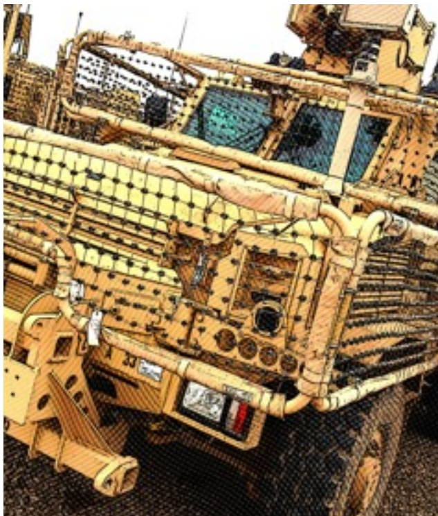
L: RG31 ready to roll.

Maintenance is a mission critical asset, and all the experiences of the Soldiers are paying huge dividends. Past deployments, civilian job skills, education, are all playing a role in the overall excellence of the Field Maintenance Team. As we go forward, new and seasoned Soldiers will learn from each other and band together to ensure the mission success of the 704th. Maintenance will not stop until the job is done!