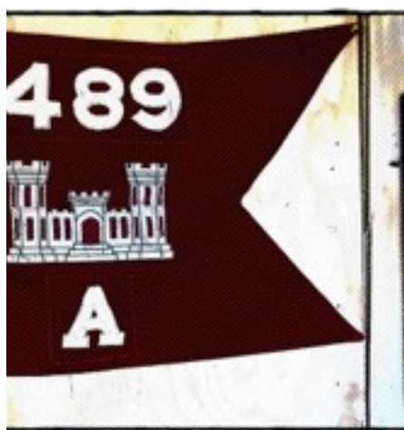
489 EN BN Alpha Company Guidon. Alpha Company was deployed to Iraq in 2003-04, and was deactivated in 2007 and the 704th EN CO was reactivated. The A CO guidon currently hangs in CPT Ys office.