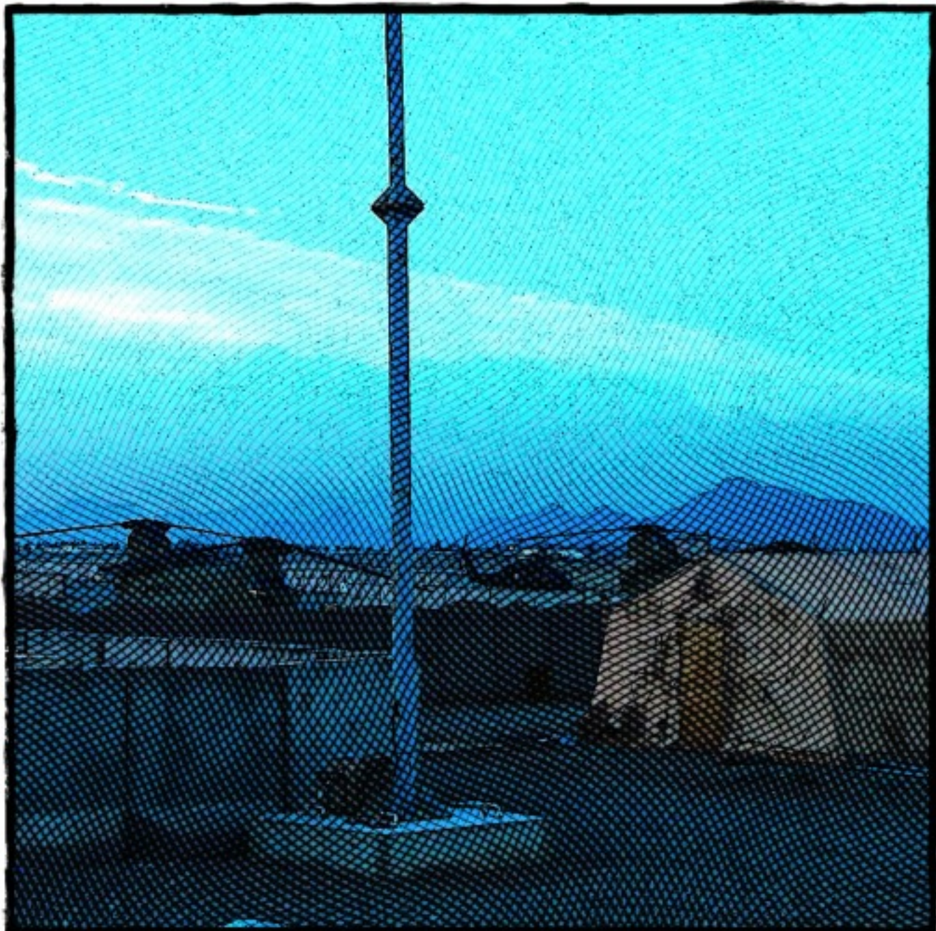
One of the first looks at the mountains of western Afghanistan