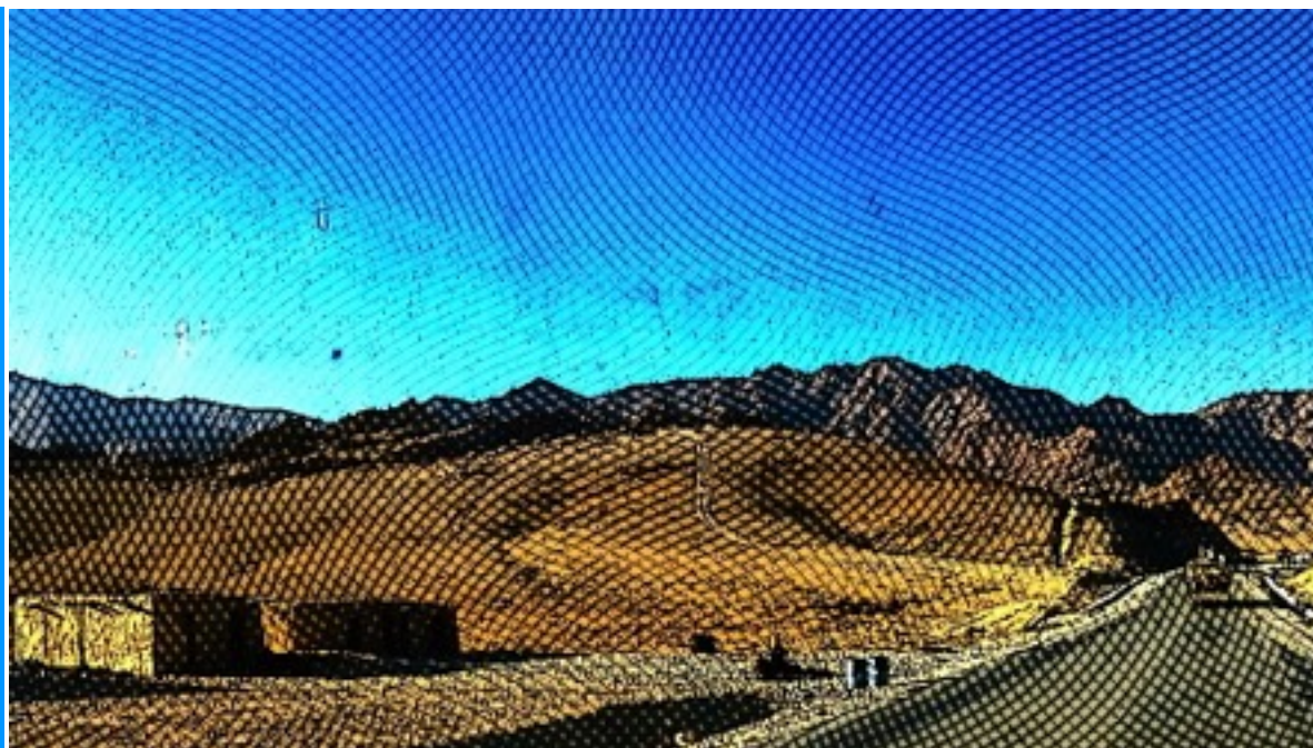
1st Platoon on patrol in the high deserts of Western Afghanistan.