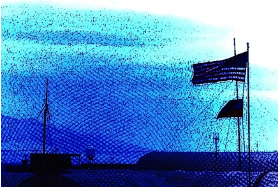
3RD PLATOON SOLDIERS STAND AT THE READY DURING FORC (Fundamentals Of Route Clearance) Training