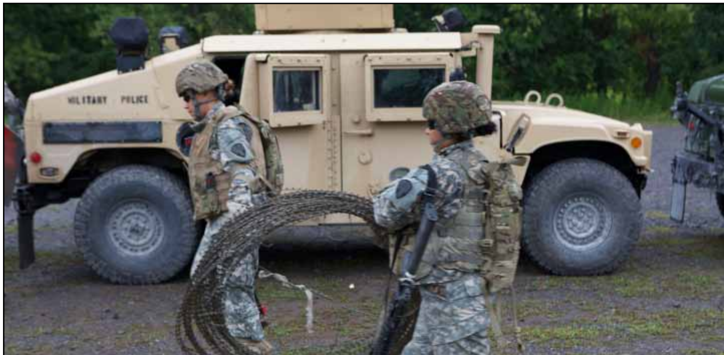
FORT DRUM, N.Y. -Female Soldiers of the 101st Expeditionary Signal Battalion conduct premobilization training Aug. 10th, 2012. The battalion, based in Yonkers, deployed to Afghanistan in Oct. 2012. Courtesy photo.

Story and photo by Eric Durr, Division of Military and Naval Affairs