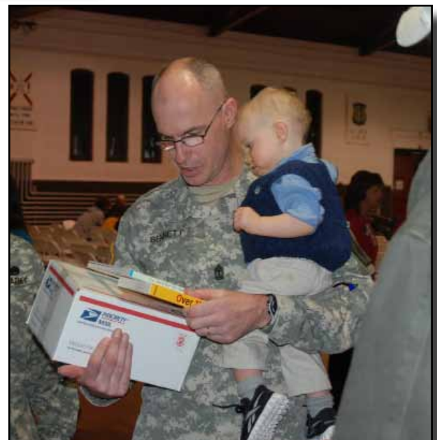
HORNELL, N.Y. -- New York Army National Guard Soldiers and family members of the 222nd Military Police Company reviews donated care packages for families at the mobilization of more than 140 Soldiers here during a unit departure ceremony Feb. 22. The military police Soldiers, based in Rochester with a detachment in Hornell, will train for overseas service at Camp Shelby, Mississippi before heading to Qatar. The unit will conduct security operations while deployed and is expected to return to New York in one year.

The unit is conducting post-mobilization training at Camp Shelby, MS prior to deploying.