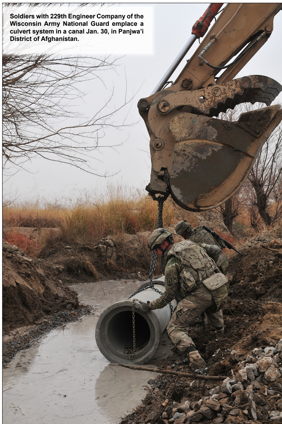
Soldiers with 229th Engineer Company of the Wisconsin Army National Guard emplace a culvert system in a canal Jan. 30, in Panjwa'i District of Afghanistan.