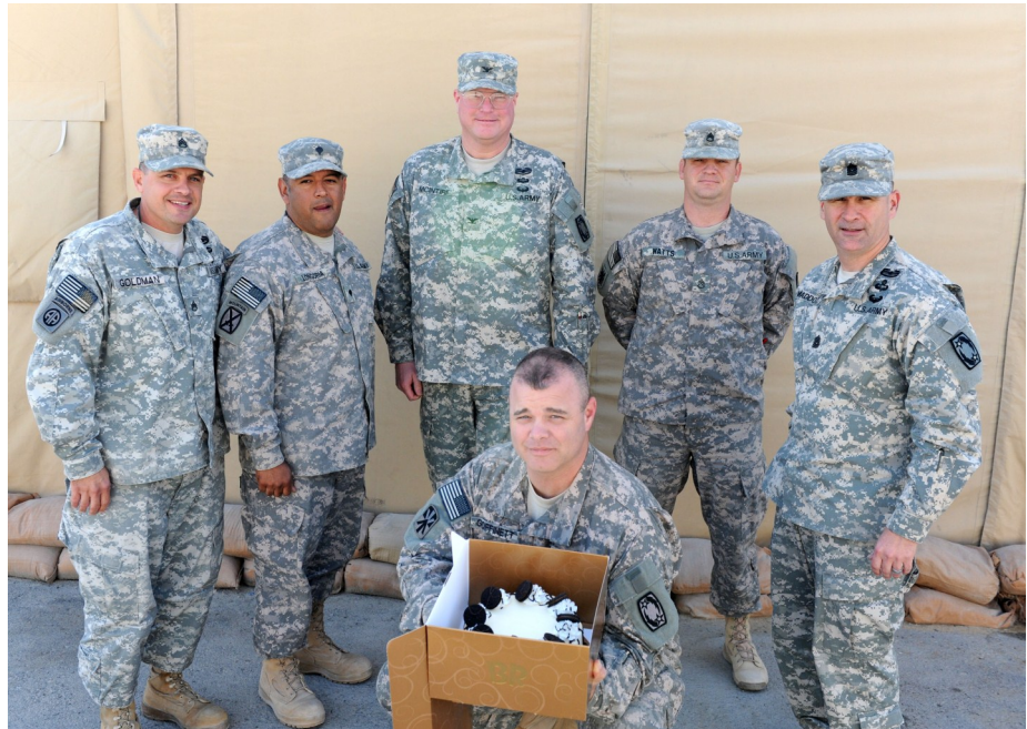
Birthday Boys complete with their cake!