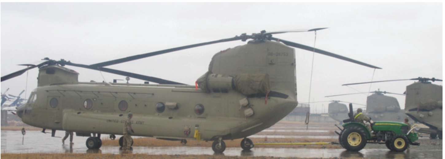
Below: KHOST, Afghanistan – Soldiers from Bravo Troop, Nomads, Task Force No Mercy move a CH-47 Chinook helicopter, February 3, 2013 in FOB Salerno. The Soldiers were still outside working on the Chinook despite the cold rain.