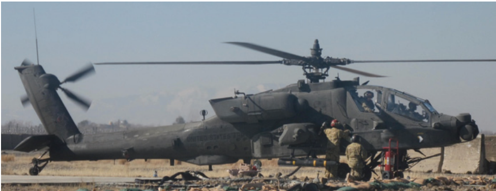
Left: Fuelers from Echo Company, Task Force No Mercy, fuel an AH-64 Apache Helicopter at the Forward Armament and Refueling Point at Forward Operating Base Salerno, Afghanistan, Feb. 7, 2013