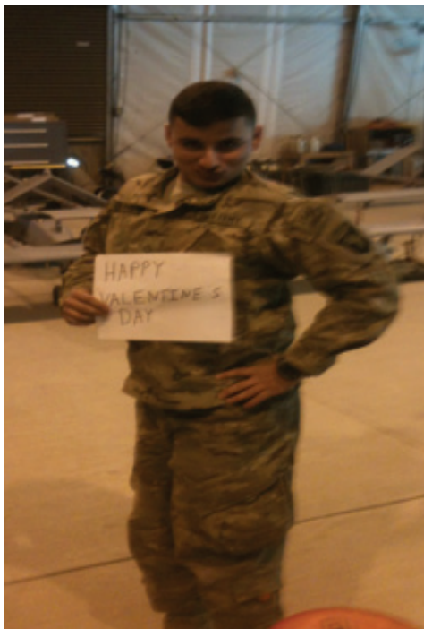
Above: FOB Fenty, Afghanistan- Soldiers from Task Force Saber contemplate life in one of the most historic cavalry units in the Army at Forward Operating Base Fenty, Afghanistan.