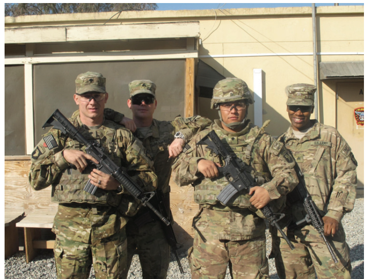
KHOST, Afghanistan –Soldiers from Echo Company, Task Force No Mercy stand outside of the Soldier of the Month board at Forward Operating Base Salerno on January 25, 2013.