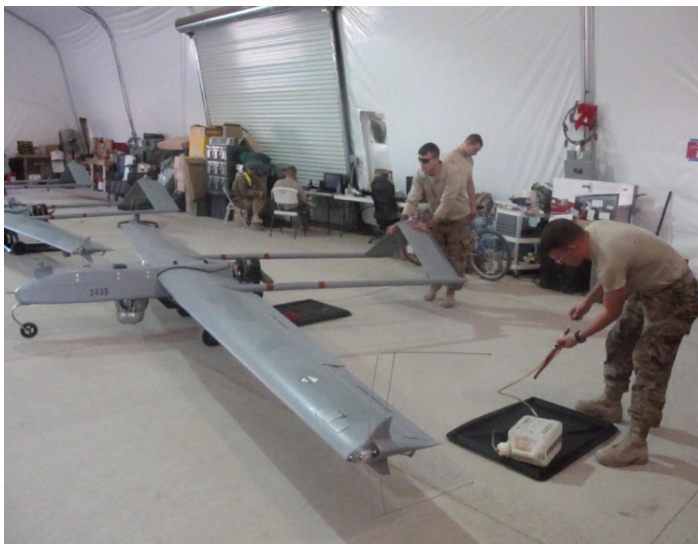
Unmanned Aerial Vehicle operators and maintainers, from F Troop, Task Force No Mercy prepare a UAV for launch at Forward Operating Base Salerno, Afghanistan, Feb. 7, 2013.