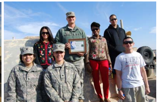
Tech Supply was named the best decorated Shop during the Christmas Holiday Season. Cheers!