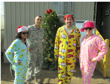
Members of Bravo company anxiously await the arrival of Santa Claus on Christmas Eve.