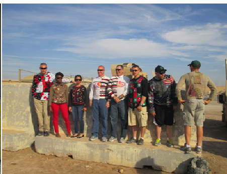
Bold and daring individuals from B 935th ASB compete in the Ugly Sweater Contest.