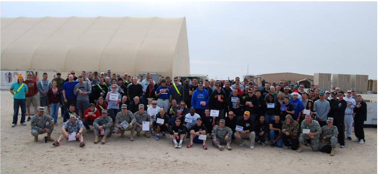
Members of the 935th Aviation Support Battalion “Work Horse” pose for an appreciation photo for all the support we have received from many organizations back home. Your continued support at home fuels our success here in the Kuwaiti desert.