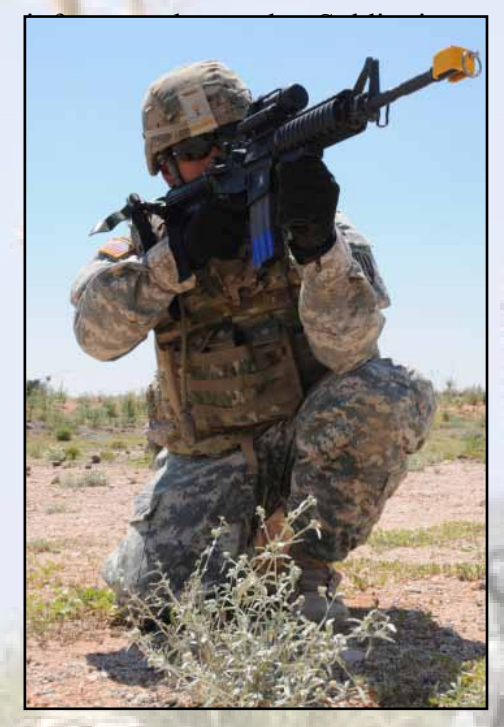
A soldier from the 101st Expeditionary Signal Battalion pulls security in a 360-degree formation with other Soldiers from the unit, after the sighting of an improvised explosive device, during a counter-IED training exercise at Camp McGregor, N.M. (Photo by Sgt. Jonathan Monfiletto, 138th PAD).

"Their main mission is signal communications but they have to be prepared to defend their position if need be, and so this training is critical for our Soldiers as well as