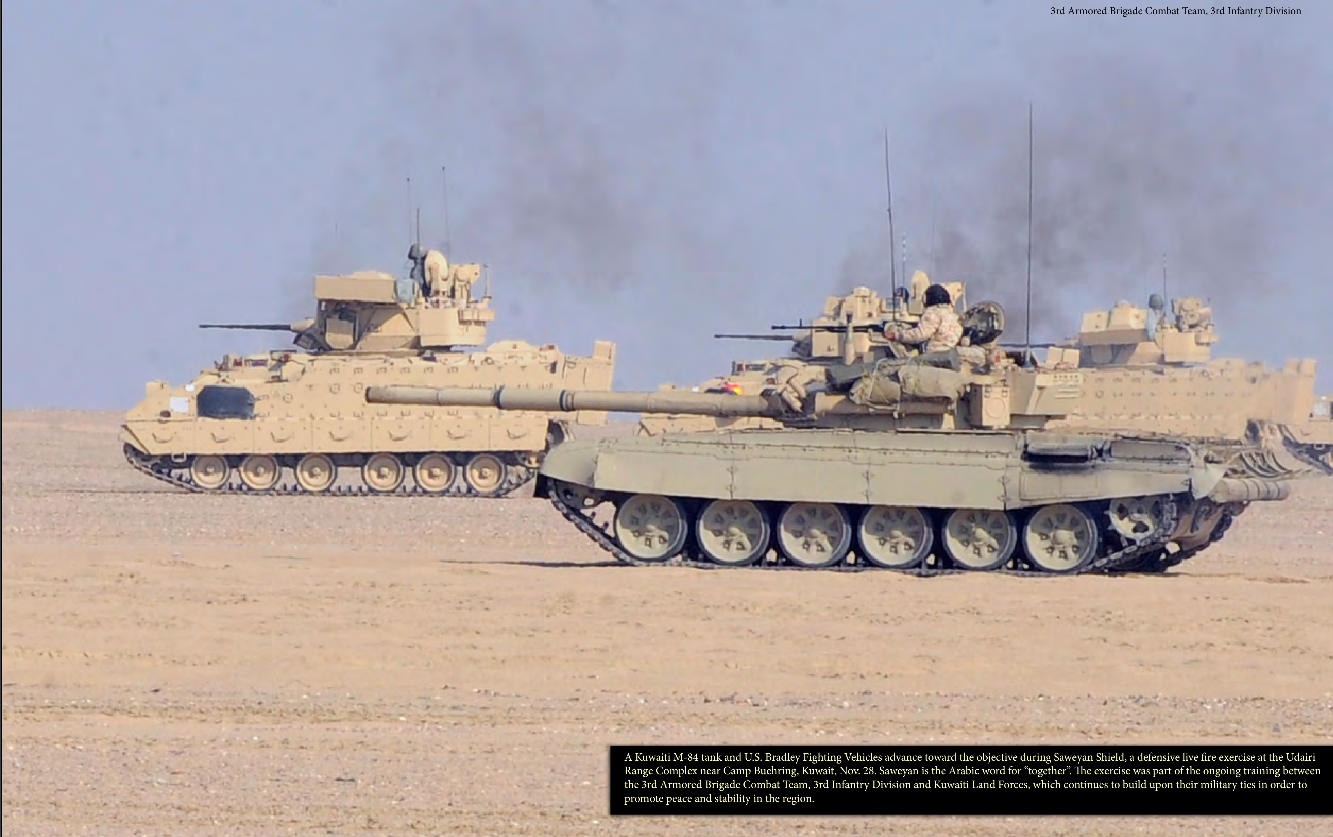
A Kuwaiti M-84 tank and U.S. Bradley Fighting Vehicles advance toward the objective during Saweyan Shield, a defensive live fire exercise at the Udairi Range Complex near Camp Buehring, Kuwait, Nov. 28. Saweyan is the Arabic word for “together”. The exercise was part of the ongoing training between the 3rd Armored Brigade Combat Team, 3rd Infantry Division and Kuwaiti Land Forces, which continues to build upon their military ties in order to promote peace and stability in the region.

JANUARY 10, 1776 COMMON SENSE, A FIFTY PAGE PAMPHLET BY THOMAS PAINE, WAS PUBLISHED. IT SOLD OVER 500,000 COPIES IN AMERICA AND EUROPE, INFLUENCING, AMONG OTHERS, THE AUTHORS OF THE DECLARATION OF INDEPENDENCE.