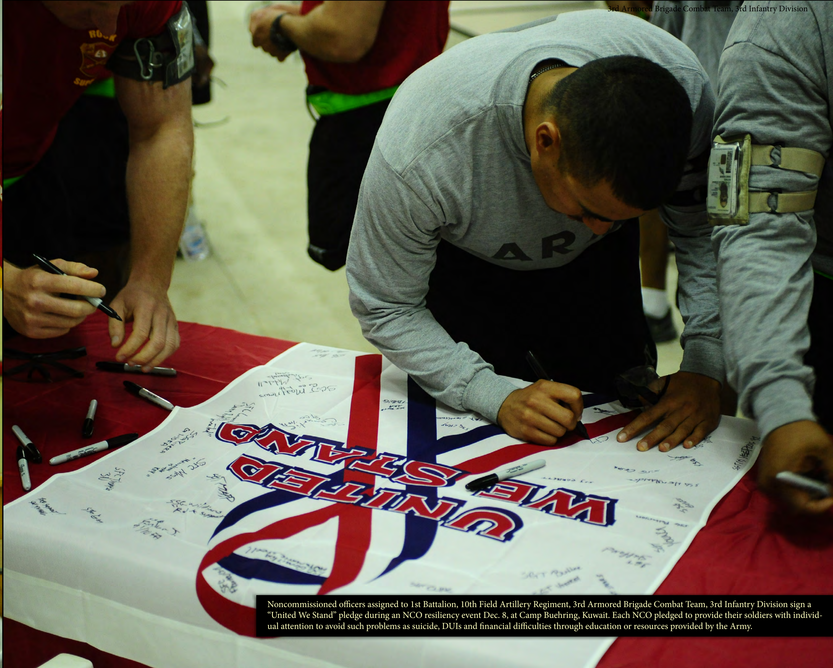
Noncommissioned officers assigned to 1st Battalion, 10th Field Artillery Regiment, 3rd Armored Brigade Combat Team, 3rd Infantry Division sign a “United We Stand” pledge during an NCO resiliency event Dec. 8, at Camp Buehring, Kuwait. Each NCO pledged to provide their soldiers with individual attention to avoid such problems as suicide, DUIs and financial difficulties through education or resources provided by the Army.