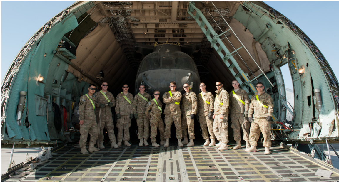
Soldiers with B Company, 96th ASB pose with their handywork after they loaded two CH-47 Chinook helicopters into an Air Force C-5 Galaxy for transport back to the U.S. for reset maintenance. The Chinook helicopter is the Army's prime heavy-lift helicopter.

Troubleshooter families and soldiers, I send my sincere gratitude for your commitment to our mission. The Troubleshooters made the best of Thanksgiving and will embrace Christmas and the New Year as blessed benchmarks that will get us closer to completing our mission and enjoying a wonderful homecoming. I thank the Troubleshooter Leaders for making our traditional Thanksgiving meal a success, as they donned the proper gear to serve our soldiers or assumed their soldiers' duties to allow them to enjoy a well deserved meal. Although the meal did not have our home flavors, it did have the Troubleshooters' family warmth.