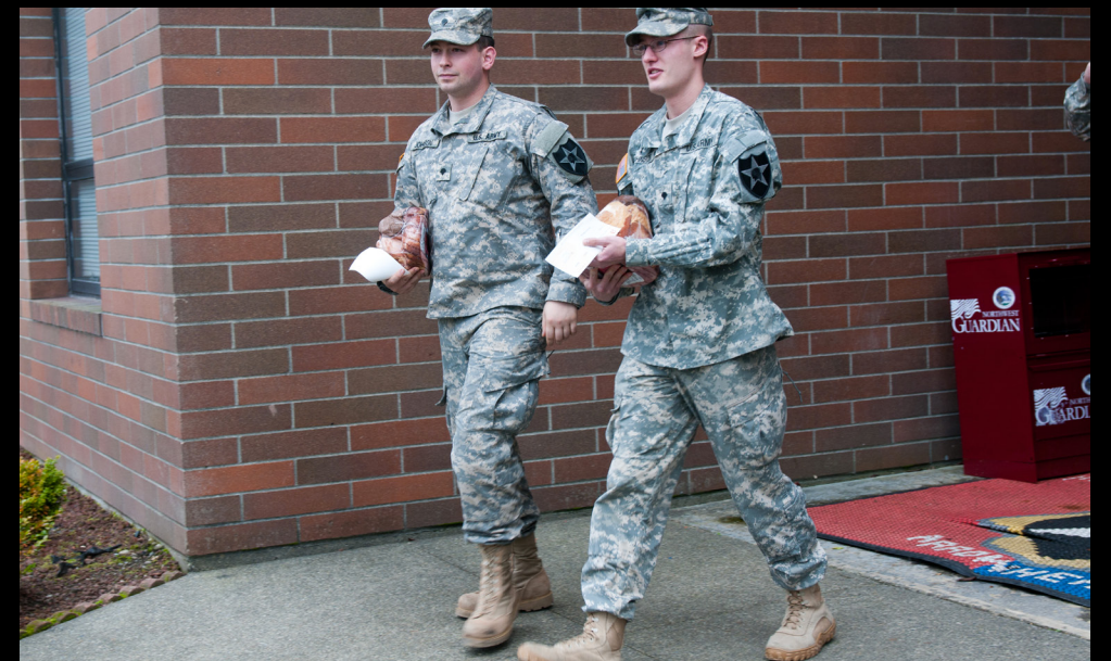
Soldiers of 3rd Stryker Brigade Combat Team, 2nd Infantry Division carry their newly donated hams home for the holidays.

Welcome home everyone! The Lacey community is so happy to have you all here, especially during the holiday season where you can have the opportunity to enjoy your time with your families. We appreciate your sacrifices, and in return, we're looking forward to having a great welcome home gathering for you. Also, during the Thanksgiving and Christmas Season, the Captain Meriwether Lewis Lacey Subchapter gathered turkeys and hams to give to lower enlisted families all over JBLM and Camp Murray.