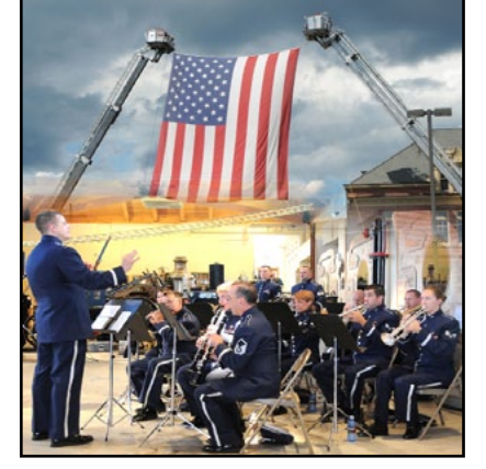
Airmen from the Air National Guard Band of the Mid-Atlantic perform during a 9/11 memorial service at the Pennsylvania National Fire Museum in Harrisburg, Pa.