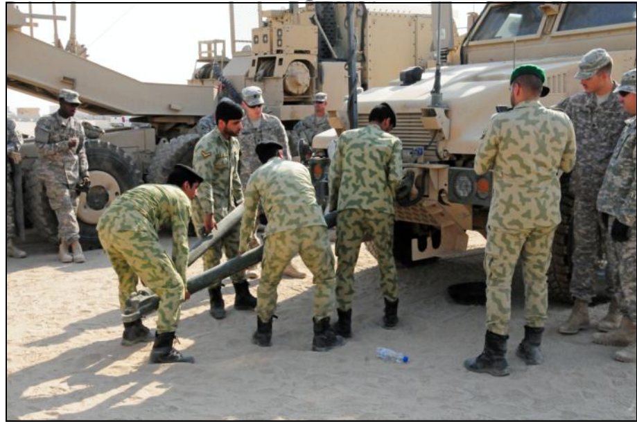
Kuwait National Guardsmen get familiar with hooking up a heavy tow bar to a Mine resistant ambush protected vehicle during the truck rodeo competition, Oct. 9. As part of Operation Steel Sword the truck rodeo is one of five-event exercise designed to foster the exchange ideas and building on the relationship between the Kuwait National Guard and the American Army.

The hasty recovery event involved backing up to a stopped Cai-