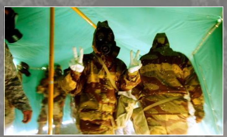
Kuwaiti and U.S. Soldiers enter a gas chamber during a chemical, biological, radiological and nuclear partnership training exercise held between soldiers of the 3rd Armored Brigade Combat Team, 3rd Infantry Division, and the 94th Brigade, Kuwaiti Land Forces, Oct. 4, at a training area near Camp Arifjan, Kuwait. Soldiers from the 3rd ABCT will continue partnership training, strengthening military ties with regional counterparts throughout the duration of their deployment.