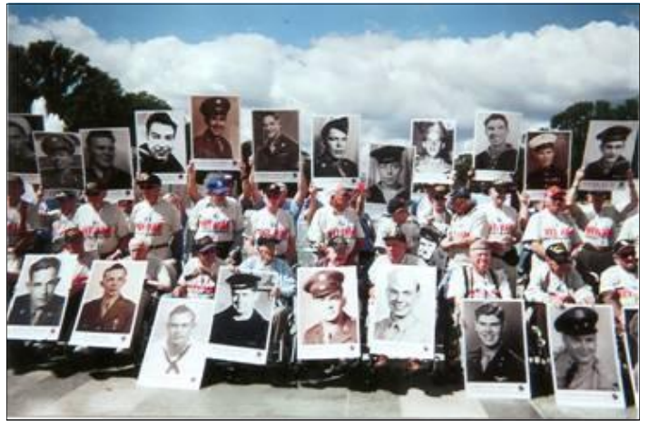
Us old codgers in our wheel chairs getting ready for group picture.

Indy Honor flight can also be found on the internet, for a much larger perspective, at www.indyhonorflight.org.