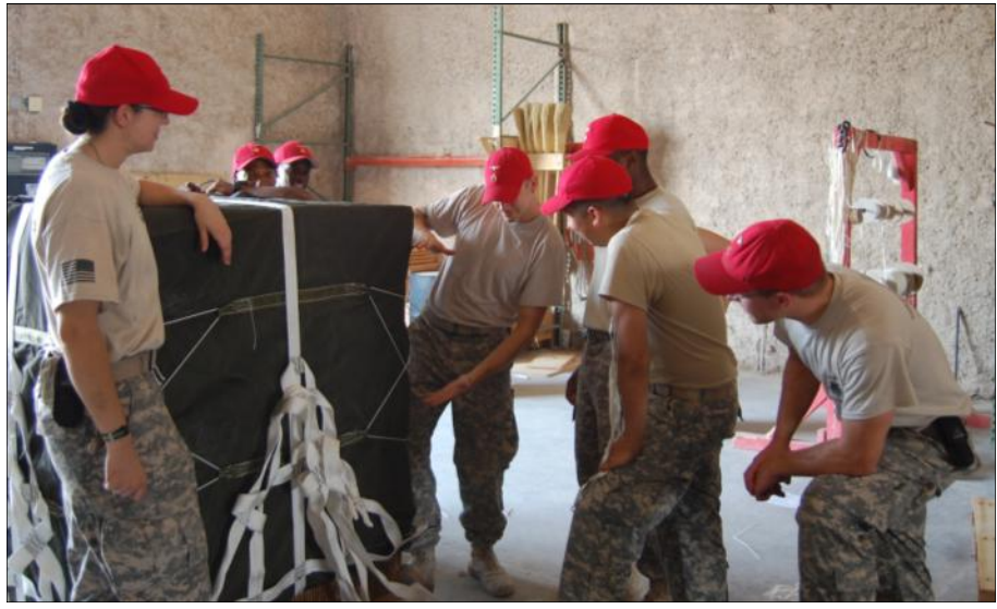
Riggers of the 421st Quartermasters at Al Udeid Air Base, Qatar, go through the process of securing the low cost containers to the loads being rigged for air drops Oct. 8.)