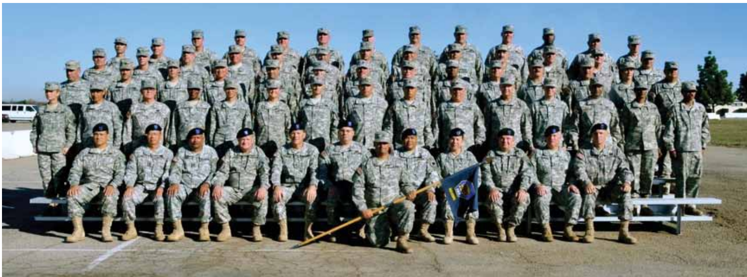
BASIC NON-COMMISSIONED OFFICER class with instructors, November 2010.